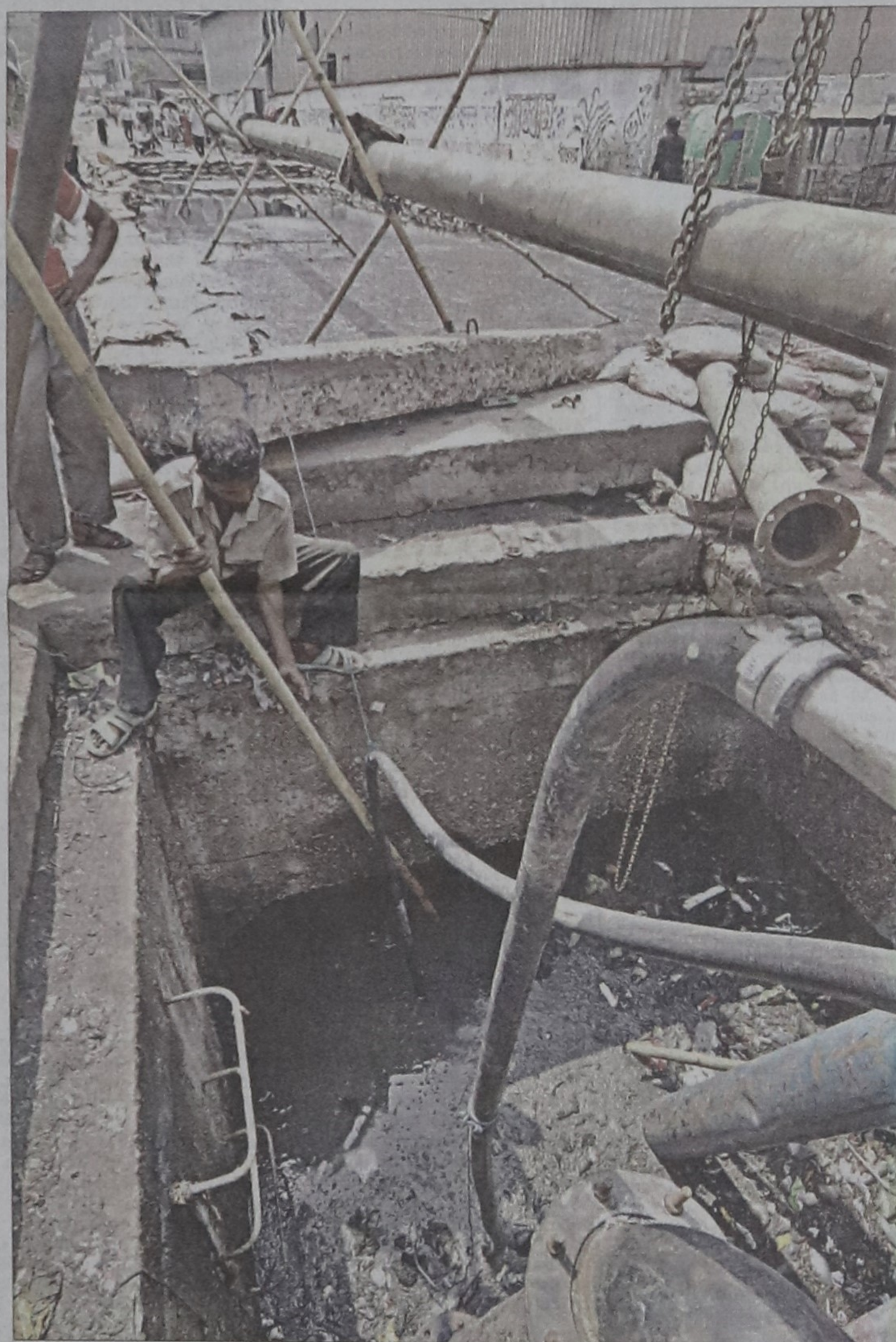
Rainwater drainage lines and sewage lines in the capital get clogged due to sewage and garbage in the same lines. The photo was taken at Motijheel-Kamalapur road as Wasa tries to clear a line.