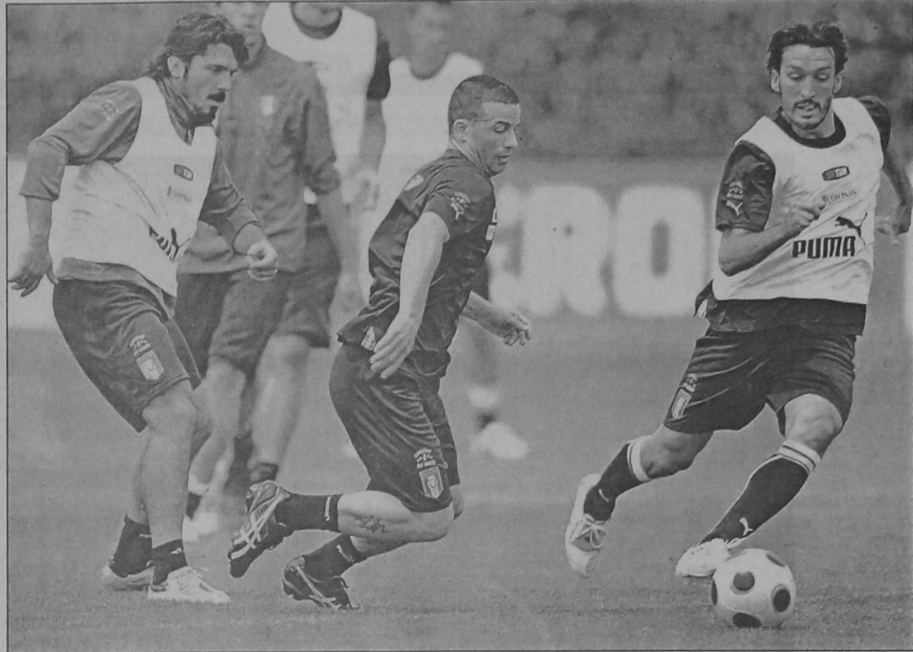
Italy midfielder Gennaro Gattuso (L) looks on as striker Antonio Di Natale (C) and defender Gianluca Zambrotta fight for possession of the ball during a training session of the Italian national team ahead of next month's Euro 2008 at the National Technical Center of Coverciano near Florence on Monday. Italy have been drawn in Group C along with France, the Netherlands and Romania for the first round of the European competition which takes place from June 7 to 29 in Austria and Switzerland.

He had scored 22 goals in La Liga in the 2004-05 season and was billed as the replacement for Andriy Shevchenko at Milan, but failed to make an impression scoring just three goals in 26 Serie A appearances. He was loaned to Zaragoza in 2007.