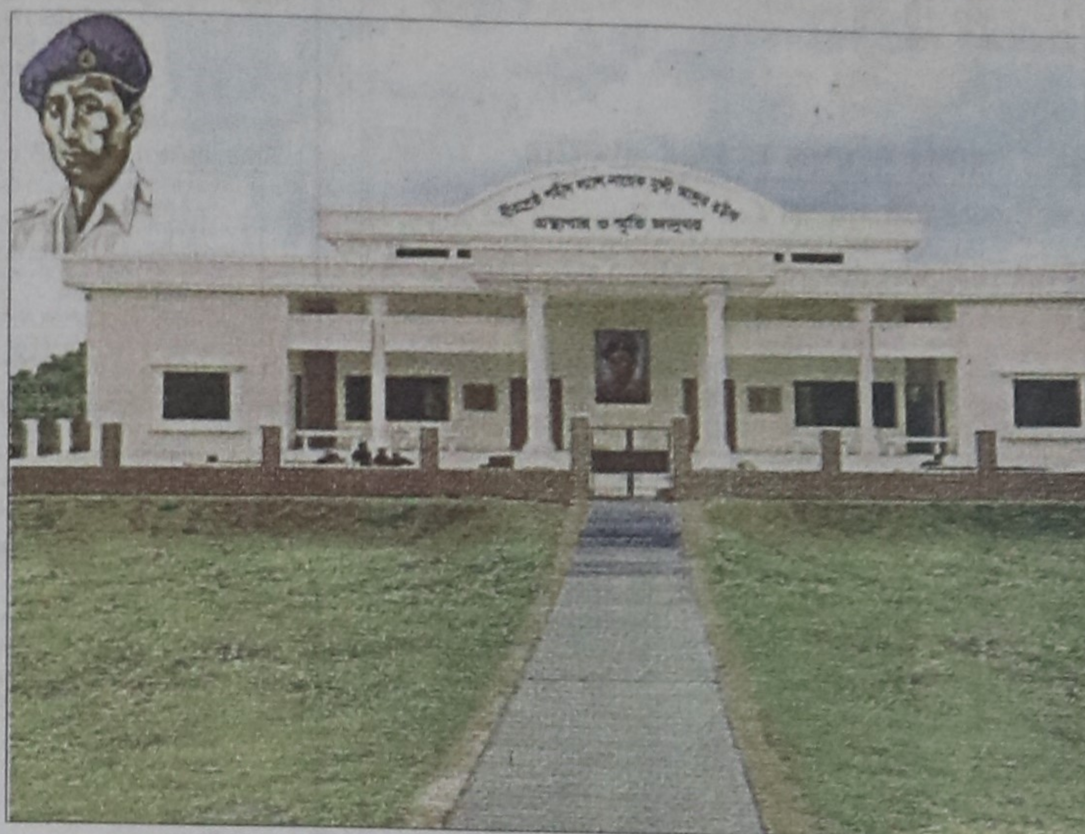
Birshreshtha Munshi Abdur Rouf Library and Museum at Roufnagar in Modhukhali upazila of Faridpur awaits inauguration tomorrow.

Faridpur Shilpakala Academy and local artistes will render cultural function at the inauguration programme.