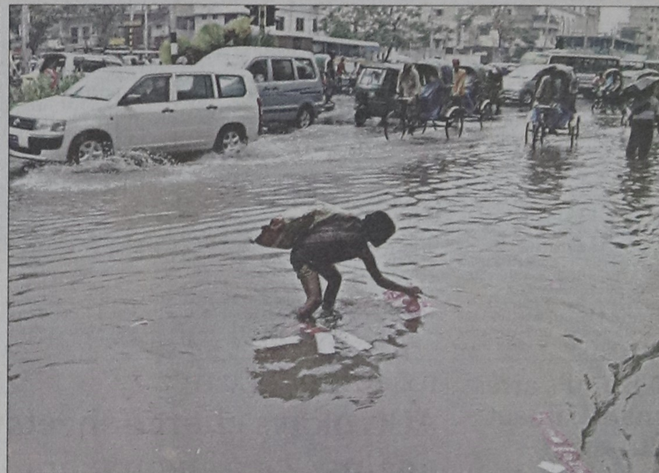
A ragpicker collects pieces of paper floating on water at Kakrail in the city after a few hours of downpour inundated the street.