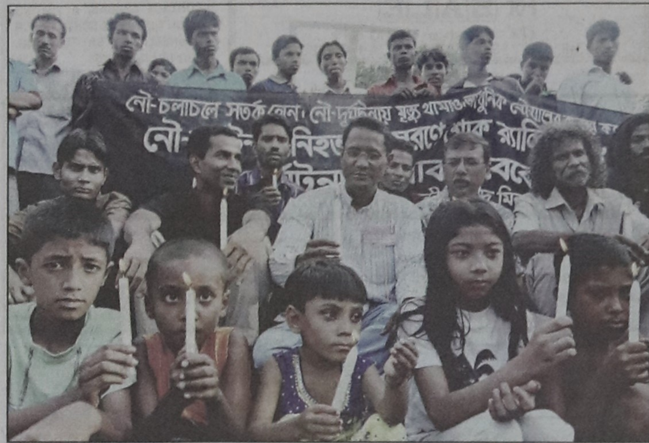
Members of Safe Water Transport Implementation Movement hold a candlelight vigil at the Central Shaheed Minar in the city yesterday in memory of the people killed in launch disasters.