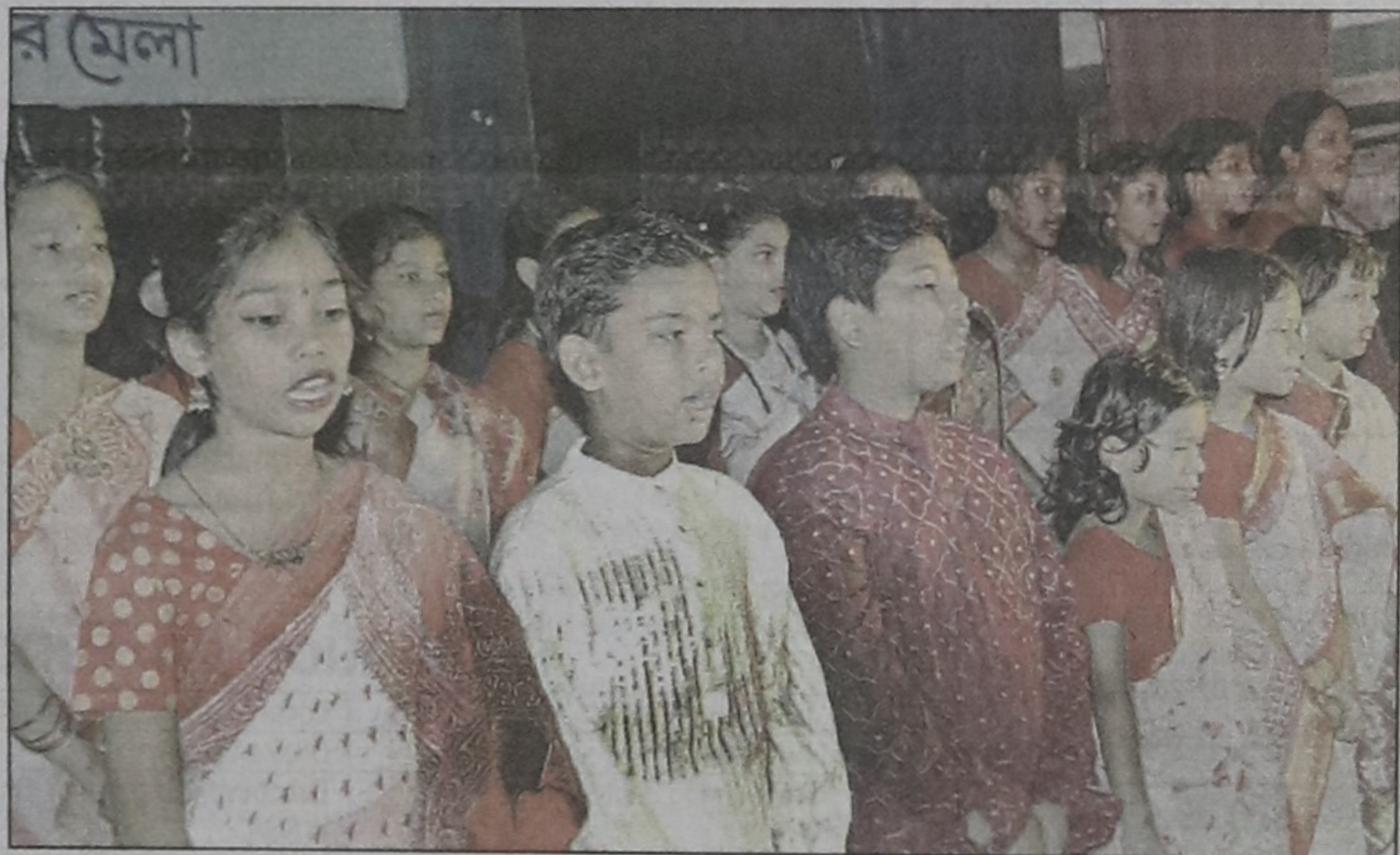
Children render songs at a cultural programme organised by Kendriya Kachi-Kanchar Mela to pay tribute to poets Rabindranath Tagore, Kazi Nazrul Islam and Sukanta Bhattacharya in the city yesterday.