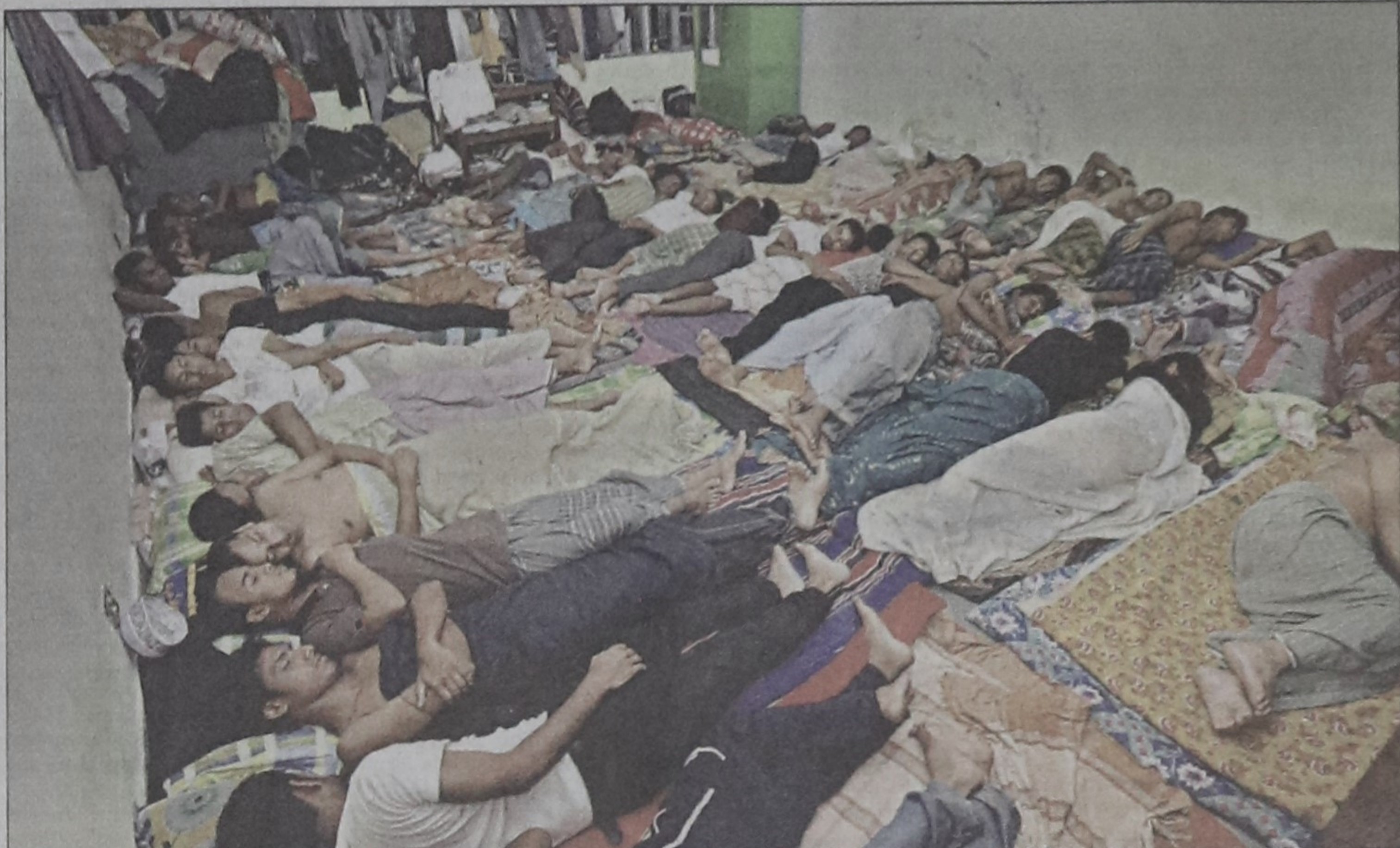
PACKED LIKE SARDINES... A large number of students of Dhaka University sleep on the floor of Bangabandhu Sheikh Mujibur Rahman Hall mosque as the authorities cannot arrange seats for them in the dormitory. The photo was taken around 2:00am yesterday.