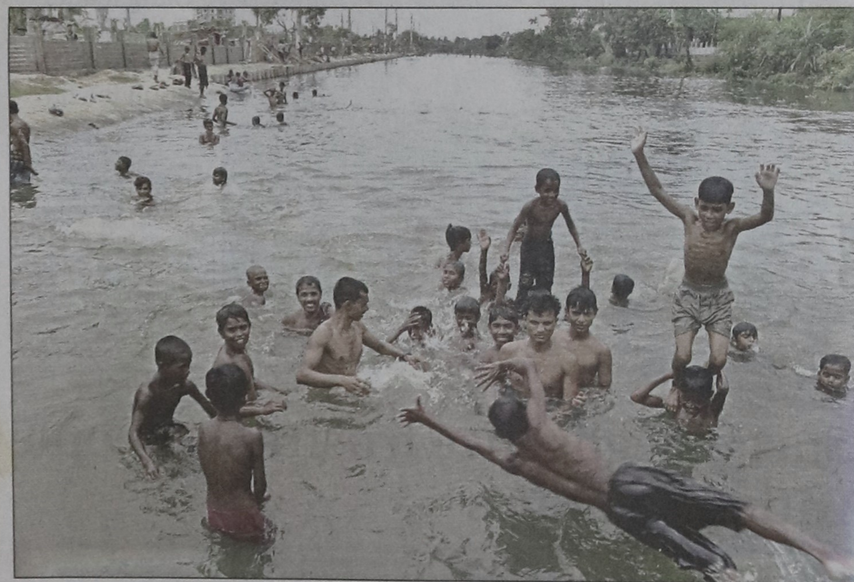
People bathe, wash clothes and litter in the DND canal in Demra ignoring Wasa prohibition. Wasa uses the water of this canal for supplying to the city.