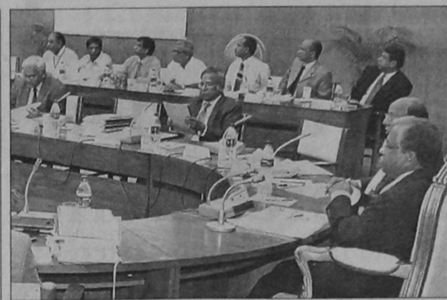
Chief Adviser Fakhruddin Ahmed presides over a meeting of the Executive Committee of the National Economic Council (Ecne) in the NEC conference room at Sher-e-Bangla Nagar in the city yesterday.

The Subarna Express, which runs on the Dhaka-Chittagong-Dhaka route, will also ply on the weekly holiday today (Friday) to facilitate the movement of the passengers, a press release of the Bangladesh Railway said.