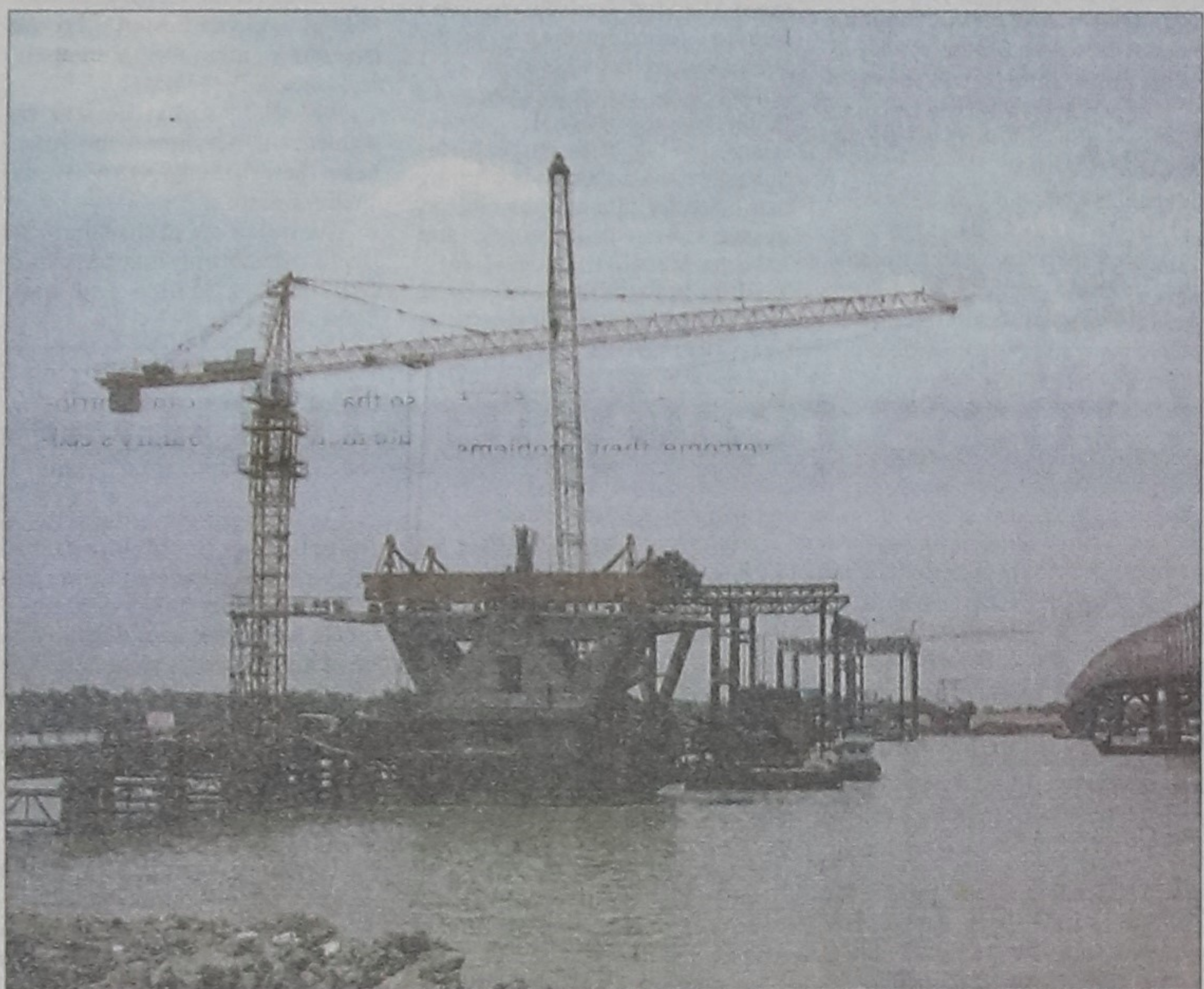
Construction work of the Third Karnaphuli Bridge is going on in full swing.

China Major Bridge Company was awarded work order for construction of the bridge within 38 months.