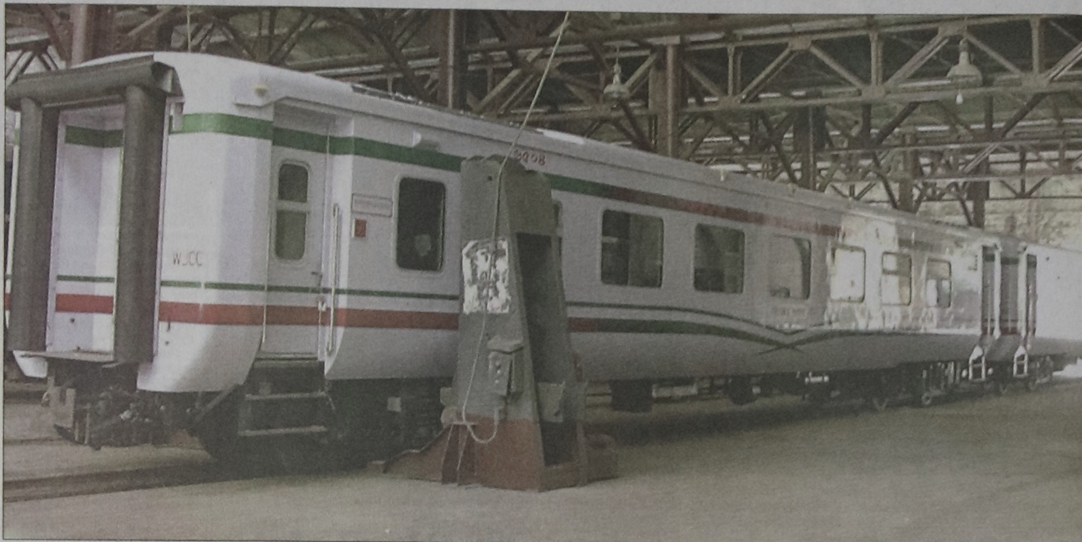
New air-conditioned coaches for Railway east zone.