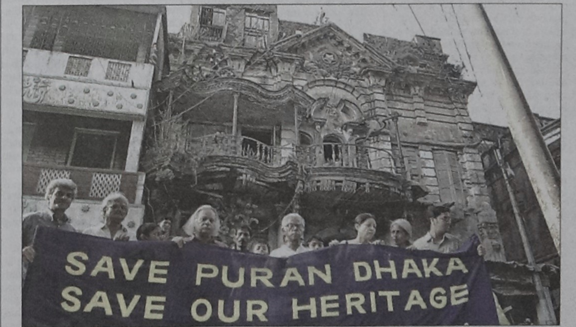
Members of the Campaign for Heritage Conservation and Urban Study Group demonstrate in front of Boro Bari on BK Das Road in Old Dhaka yesterday protesting a plan for demolishing the architectural heritage of the city.

of 1,850 kilogram (kg) with high level of biochemical oxygen demand (BOD) gets drained into the low lying lands of eastern Dhaka from the industrial zone, which subsequently gets into the Balu river via Begunbari and Norai canals, causing serious damage to the adjacent paddy fields of the area, states the 'Study on Alternative Location of the Intake of Saidabad Water Treatment Plant', commissioned by Wasa in May 2006. "Pitch black effluents from Tejgaon Industrial Area containing