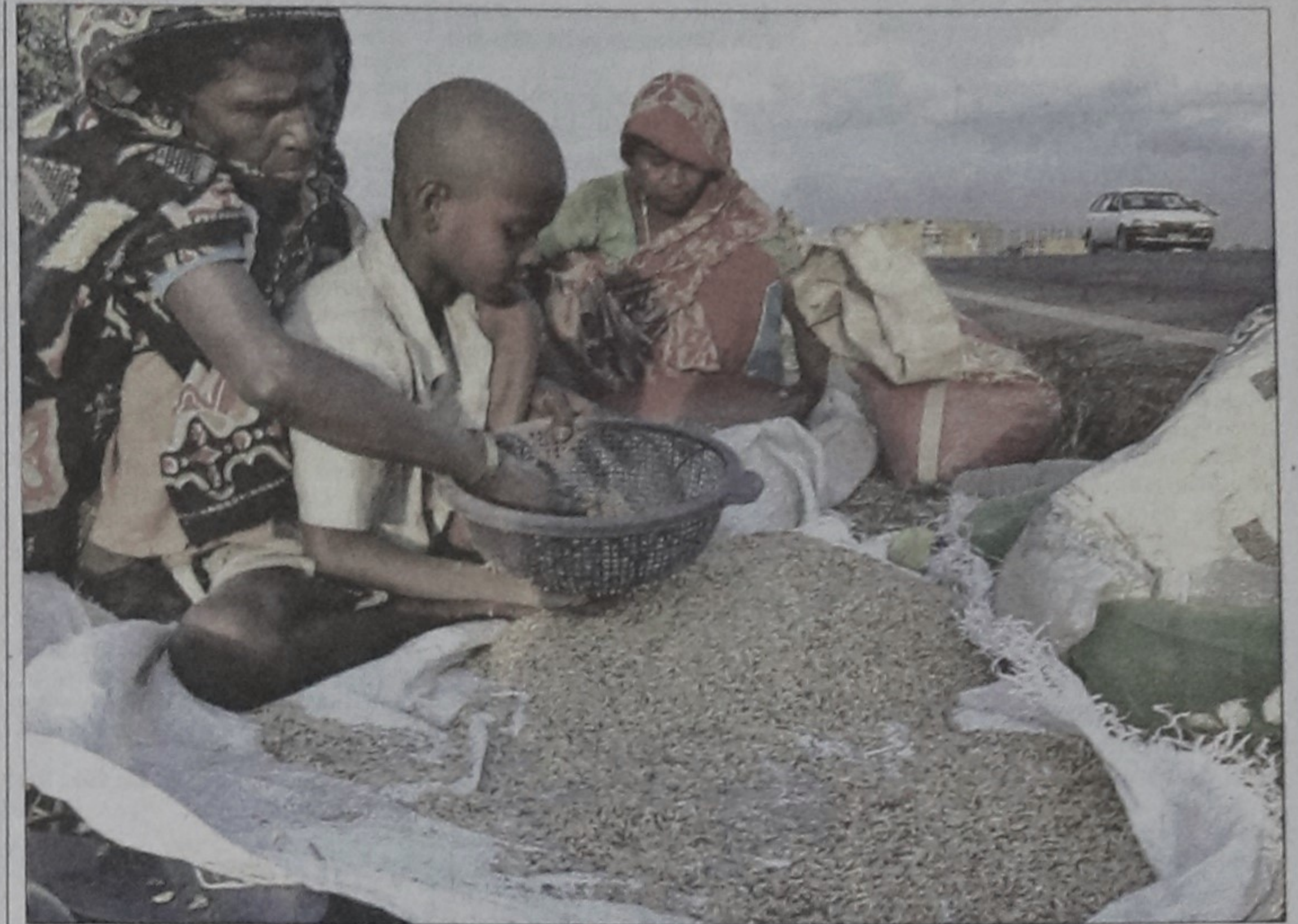
Poor people separate pebbles from rice grains on a roadside in Ashulia on the outskirts of the capital yesterday. The few kgs of rice fell on the road while being transported.