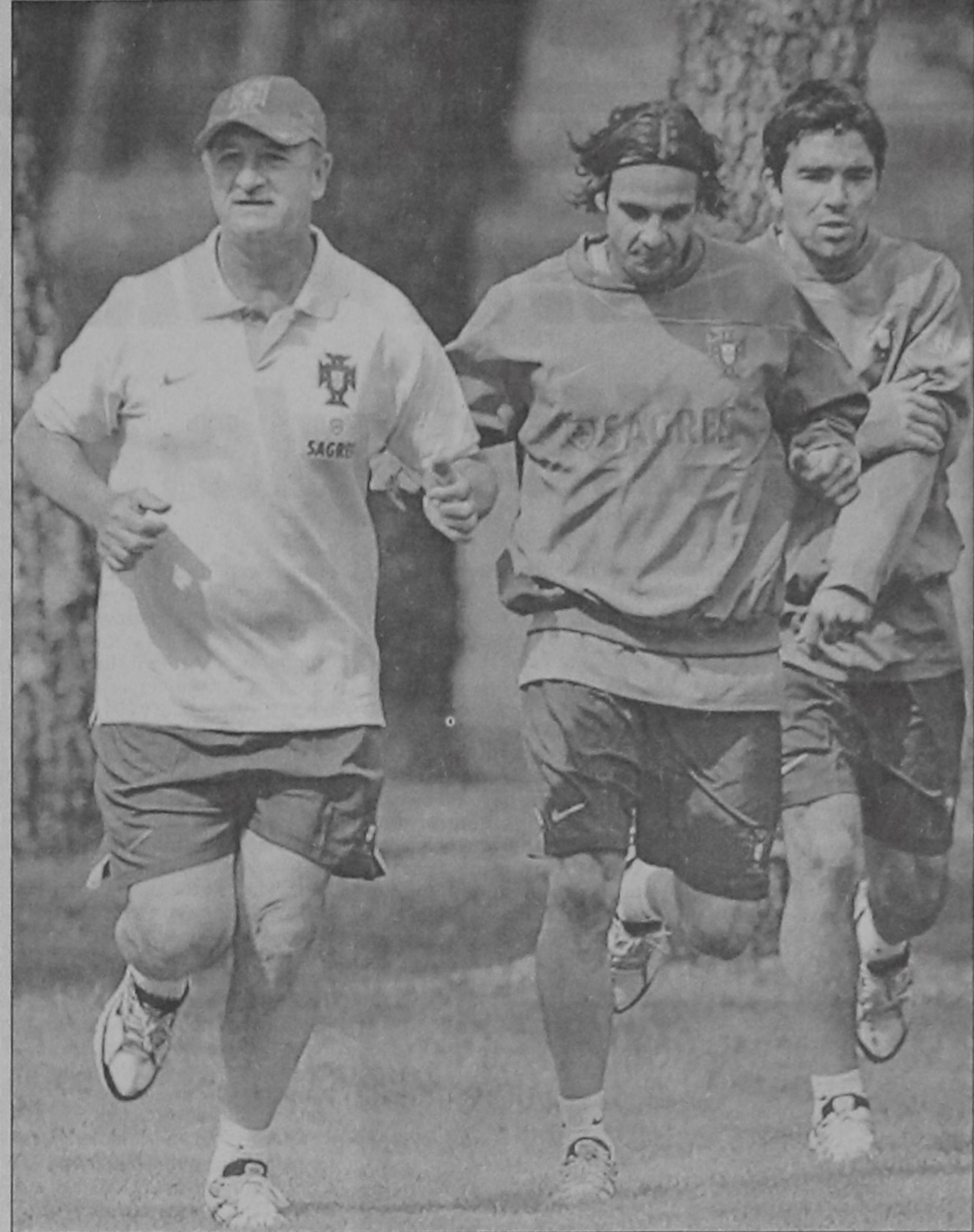
Portugal's Brazilian coach Luiz Felipe Scolari (L) jogs with striker Nuno Gomes (C) and midfielder Deco during their training session at the Montebelo Golf Course yesterday.

In the Manchester case, he is due to stand trial accused of assaulting his former Manchester City team mate Ousmane Dabo in a training ground incident in May last year that effectively ended his career with the club. He has pleaded not guilty. Barton, who has one England cap, joined Newcastle United for 5.8 million pounds ($11.33 million) in July 2007.