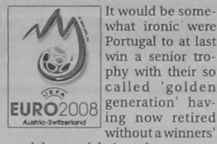
EURO 2008 Austria-Switzerland

It would be somewhat ironic were Portugal to at last win a senior trophy with their so called 'golden generation' having now retired without a winners' medal around their necks.