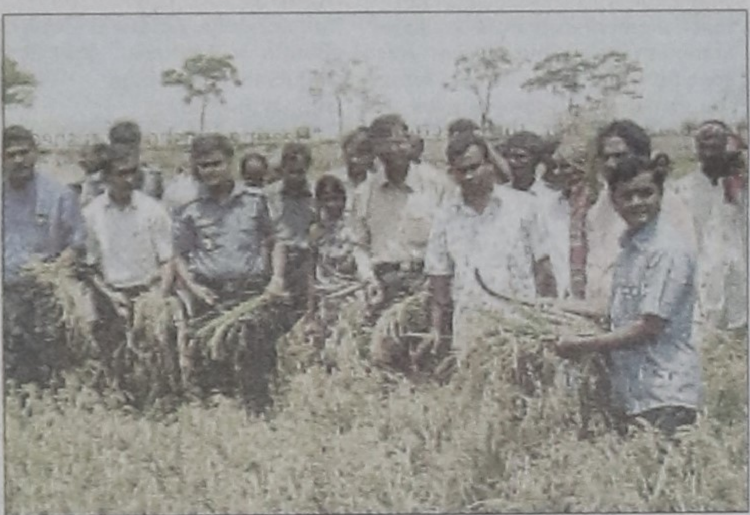
With starting of late Boro harvesting in Beelkuralia in Pabna district on Monday, jobless people thronged there to get the work of labourers in the field.