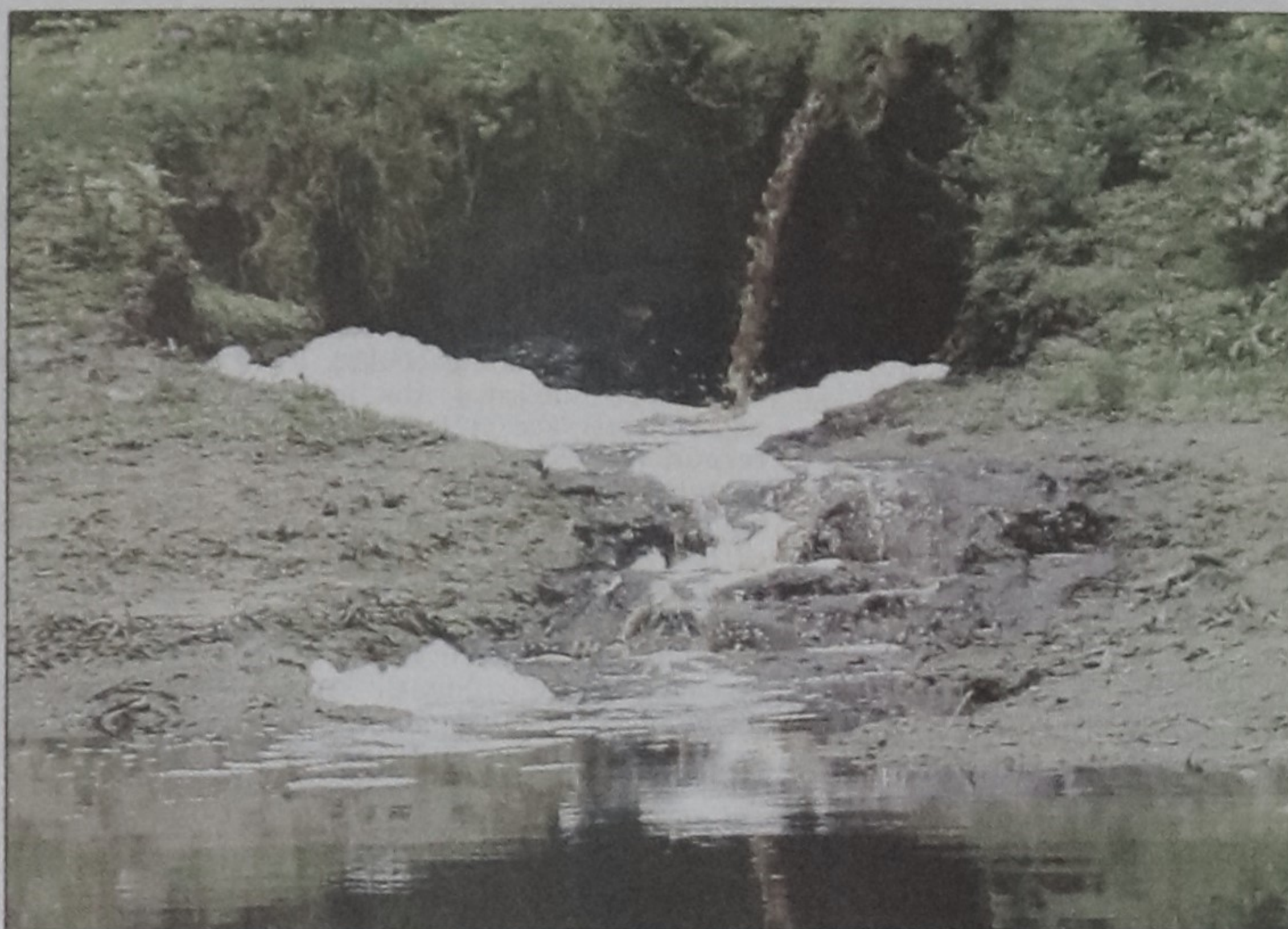
Untreated toxic wastes from Alauddin Textile Mills being released to Louhajang River at Kudirampur in Tangail Sadar upazila.

Badiuzzaman Khan, extension officer of BSCIC, however, claimed