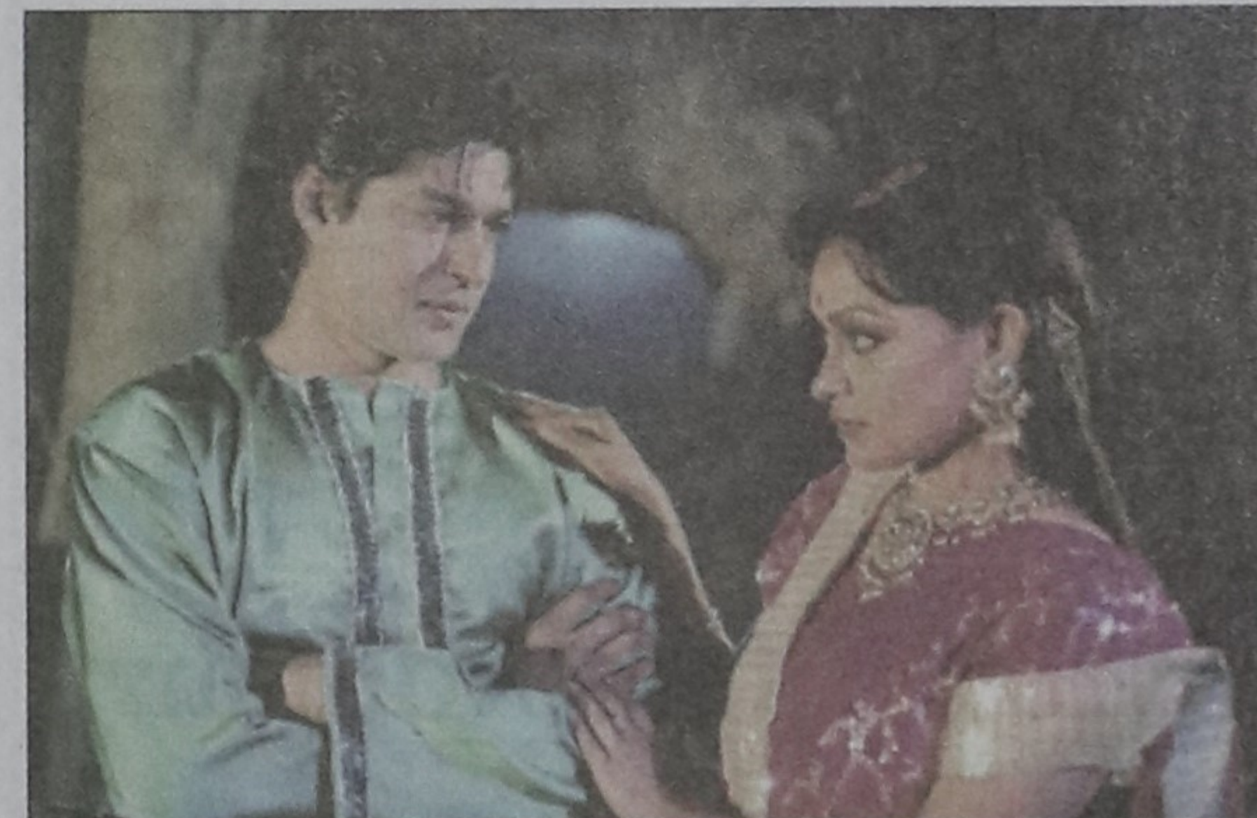
A scene from the serial