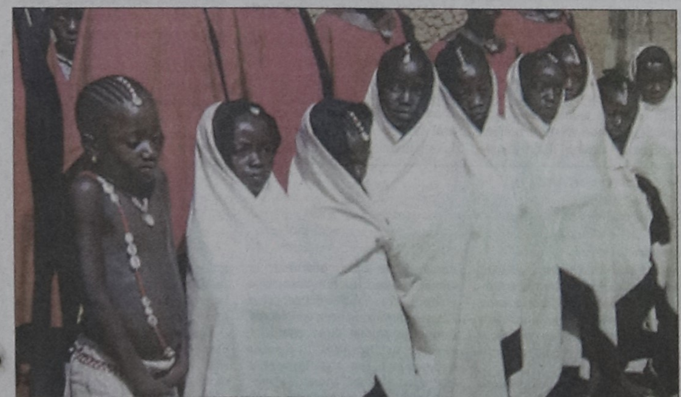
A scene from Sembene's film Moolaade

Zahir Raihan Film Society celebrates 22nd anniversary