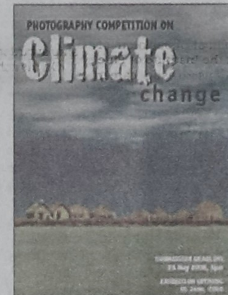
Photo competition on climate change

FK Bangladesh Network invites submissions for a photography competition on the theme "Climate Change". Selected photos will be featured at a touring exhibition on the cause and effect of climate change in Bangladesh, says a press release. The exhibition will be launched at Drik Gallery on the World Environment Day, June 5, 2008.