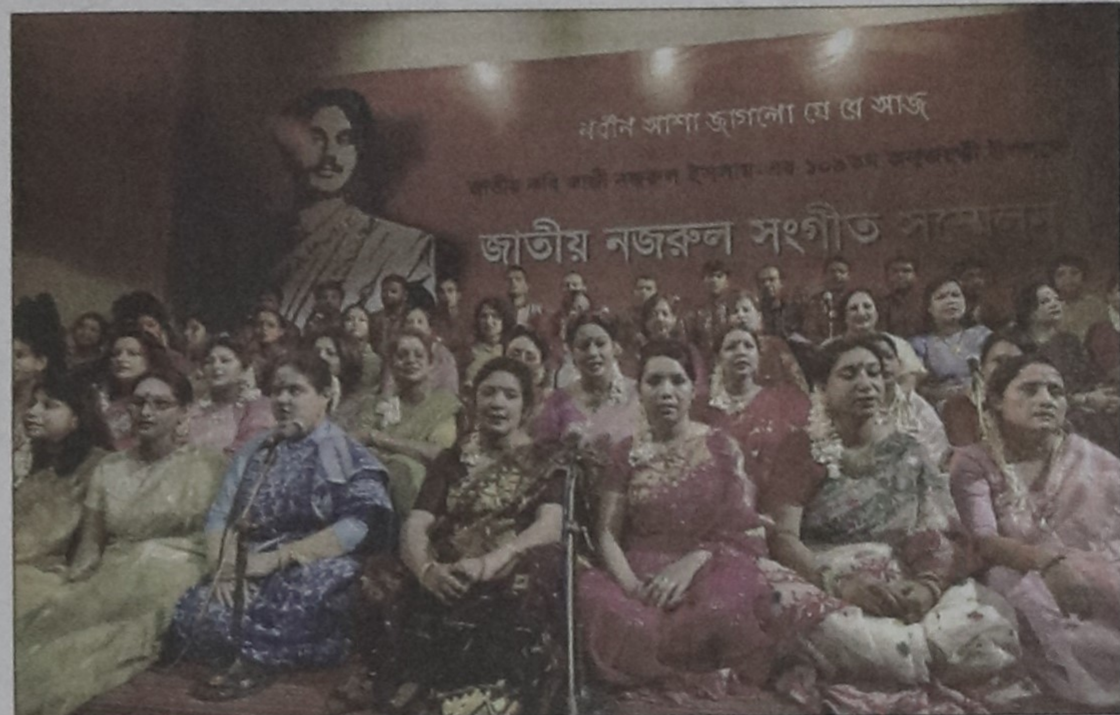
Choral rendition by artistes of Nazrul Sangeet Shilpi Parishad

Jatiya Nazrul Sangeet Sammelan at Public Library