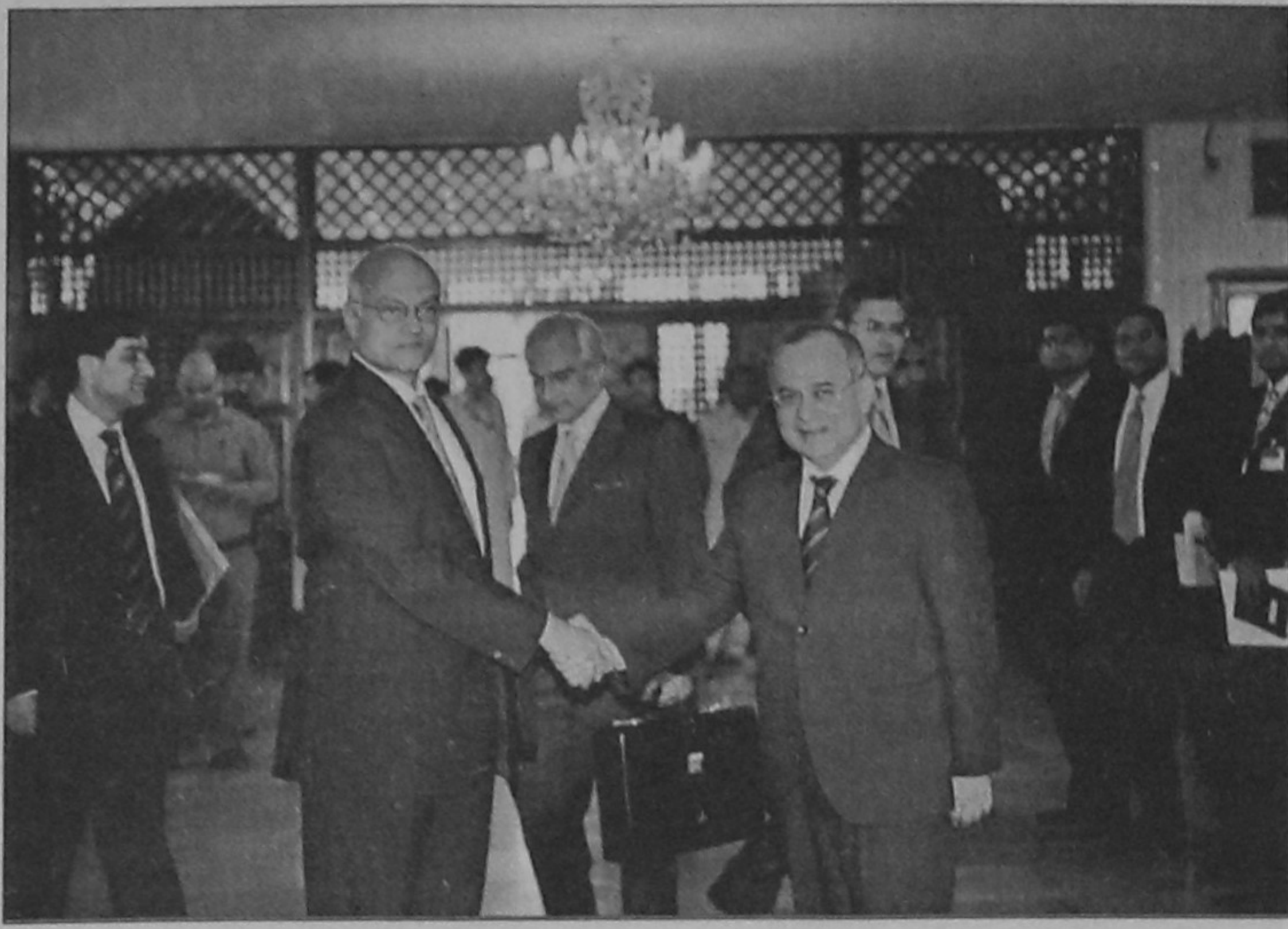
Pakistani foreign secretary Salman Bashir (R) shakes hands with Indian counterpart Shivshankar Menon upon his arrival at the foreign ministry in Islamabad yesterday.