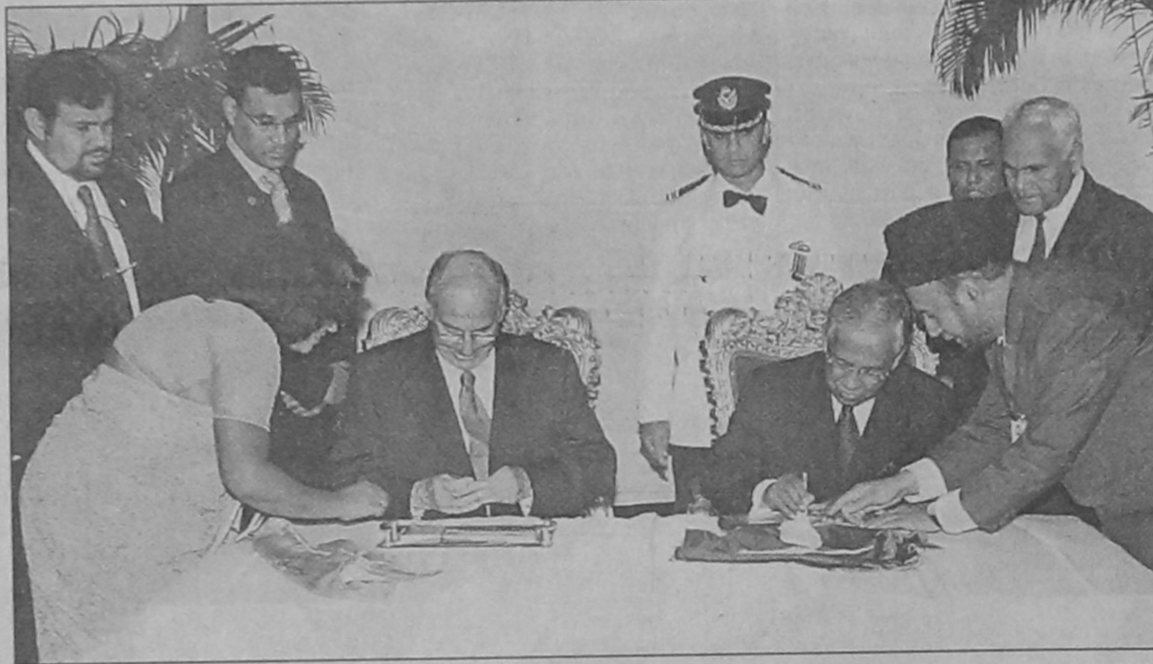
Chief Adviser Fakhruddin Ahmed releases two commemorative stamps at Hotel Sonargaon in the city yesterday to mark the 50 years of Prince Karim Aga Khan's leadership of the world's Ismaili Muslims. On his right is Prince Aga Khan.