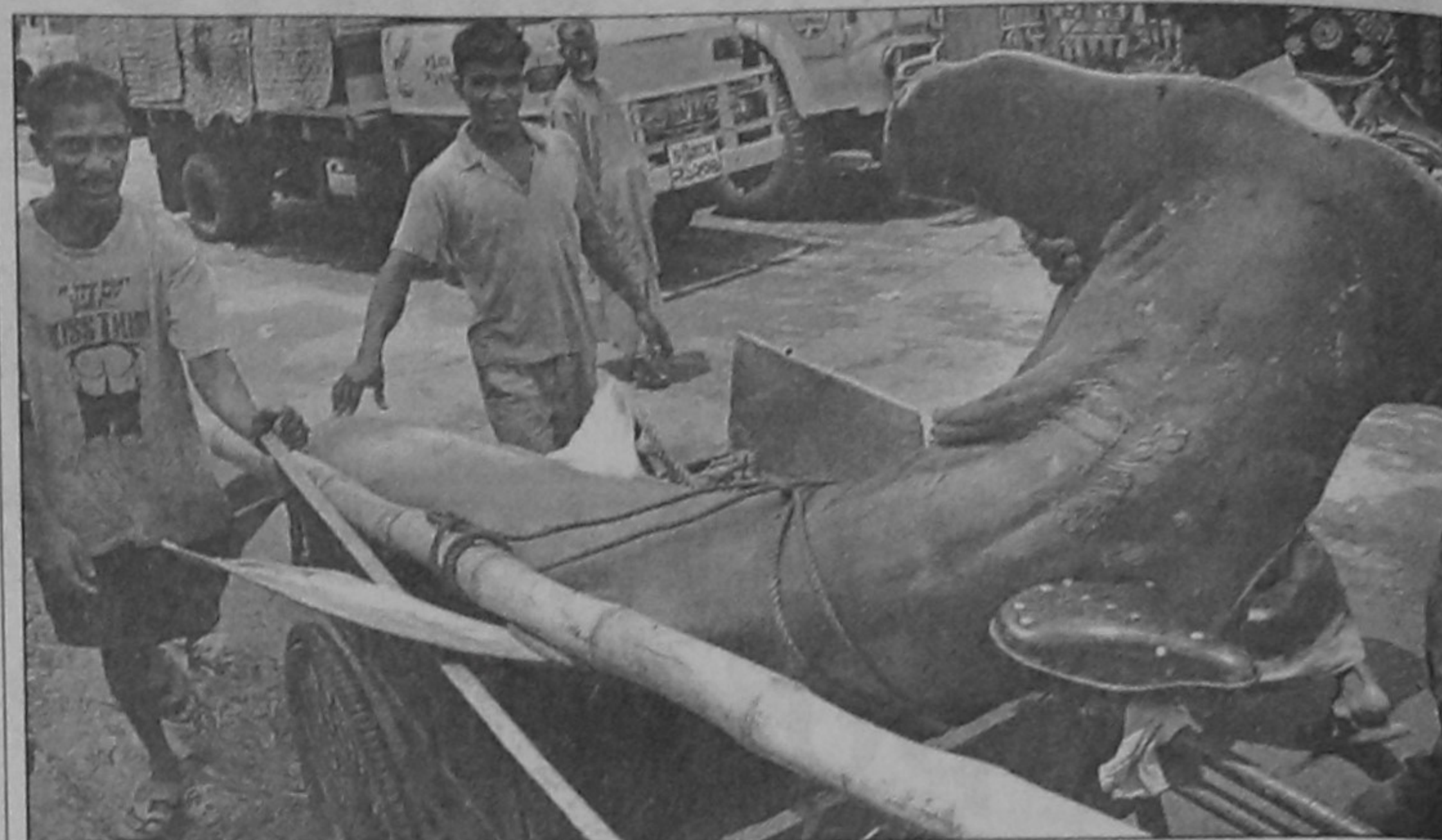
This big shark, caught in the deep sea yesterday, was brought to Fishery Ghat in Chittagong and cut into pieces in the afternoon for selling them among people.

Later, a ceremonial motorcade took Aga Khan to Tejgaon Old Airport from where he flew to Savar National Memorial to pay respect to the martyred freedom fighters of the Independence War.