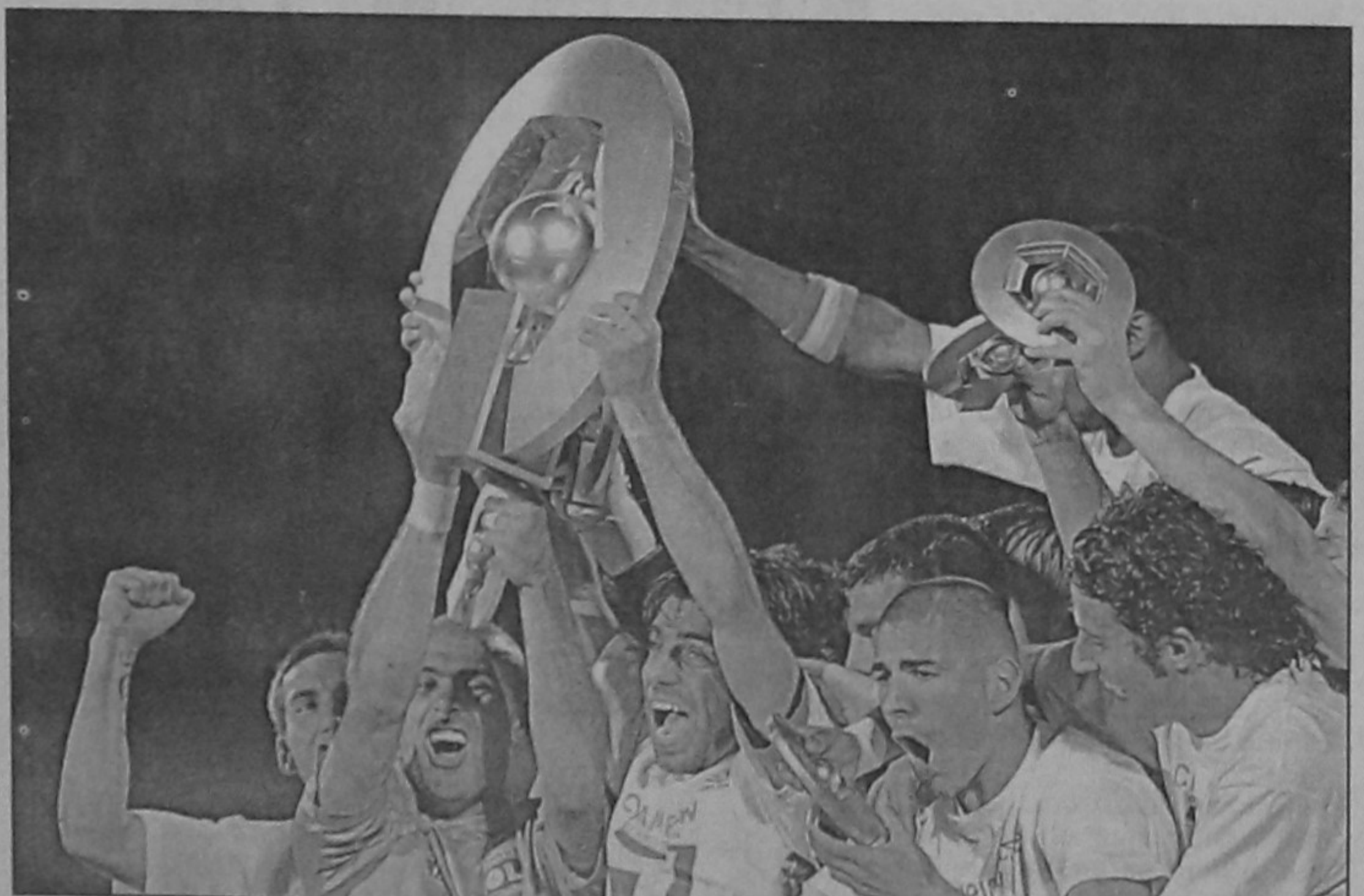
Lyon players celebrate with the trophy after their victory over Auxerre during their League One match at the Abbe Deschamps Stadium in Auxerre on Saturday.

St Etienne go into the UEFA Cup along with Nancy after thrashing Monaco 4-0, as do PSG by dint of their League Cup success.