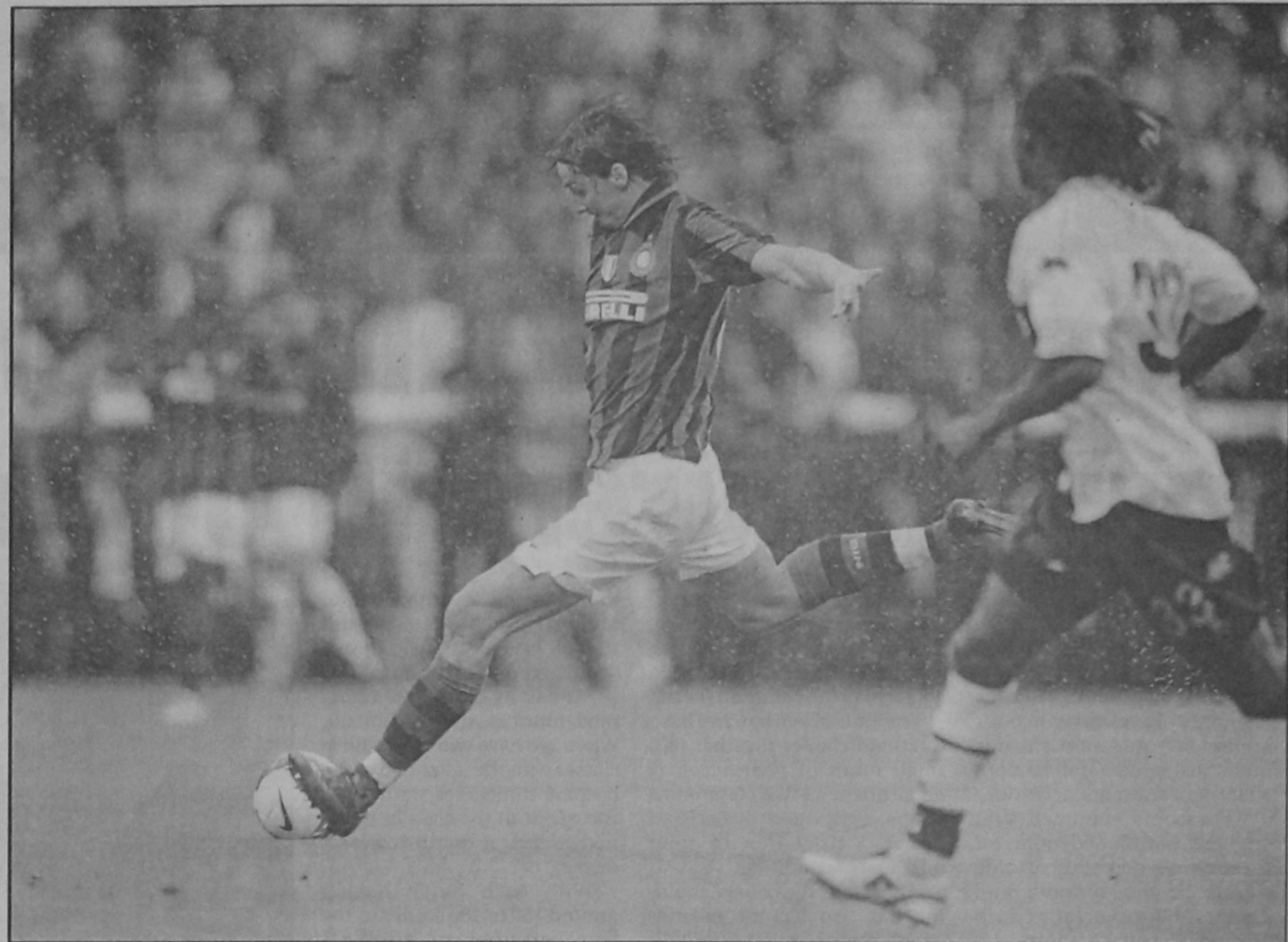
Inter Milan striker Zlatan Ibrahimovic scores his second goal against Parma during their Serie A encounter at the Tardini Stadium in Parma yesterday.

Milan ultimately paid for last week's 3-1 defeat at Napoli and their comfortable home win over Udinese, with goals from Pato, Filippo Inzaghi, Cafu and Clarence Seedorf will be of no consolation to coach Carlo Ancelotti.