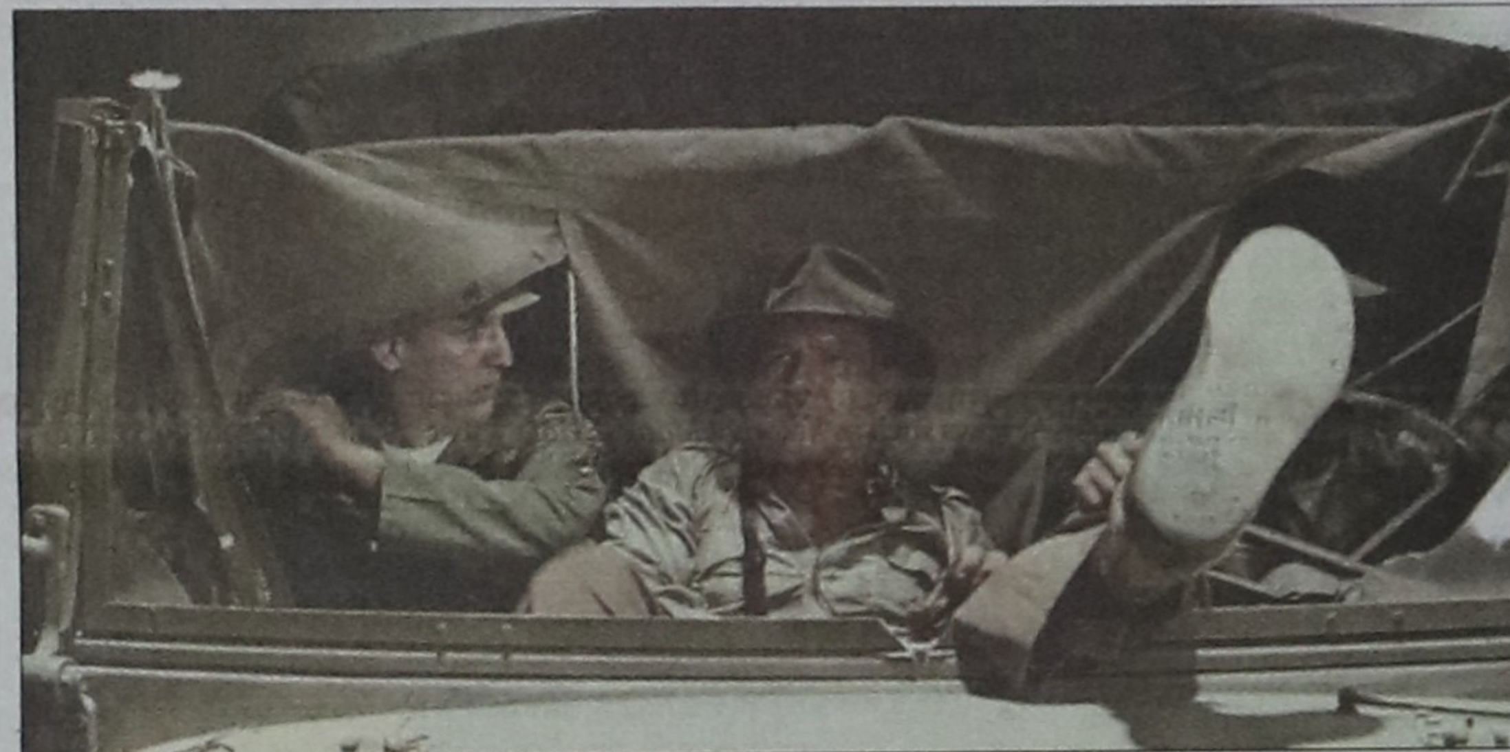
Harrison Ford (C) in Indiana Jones and the Kingdom of the Crystal Skull

Asked if he, Spielberg and Ford were planning a fifth Indiana Jones movie, Lucas replied: "Harrison, Steven and I haven't talked about it. We can't do it unless I can come up with a good idea, which I haven't."