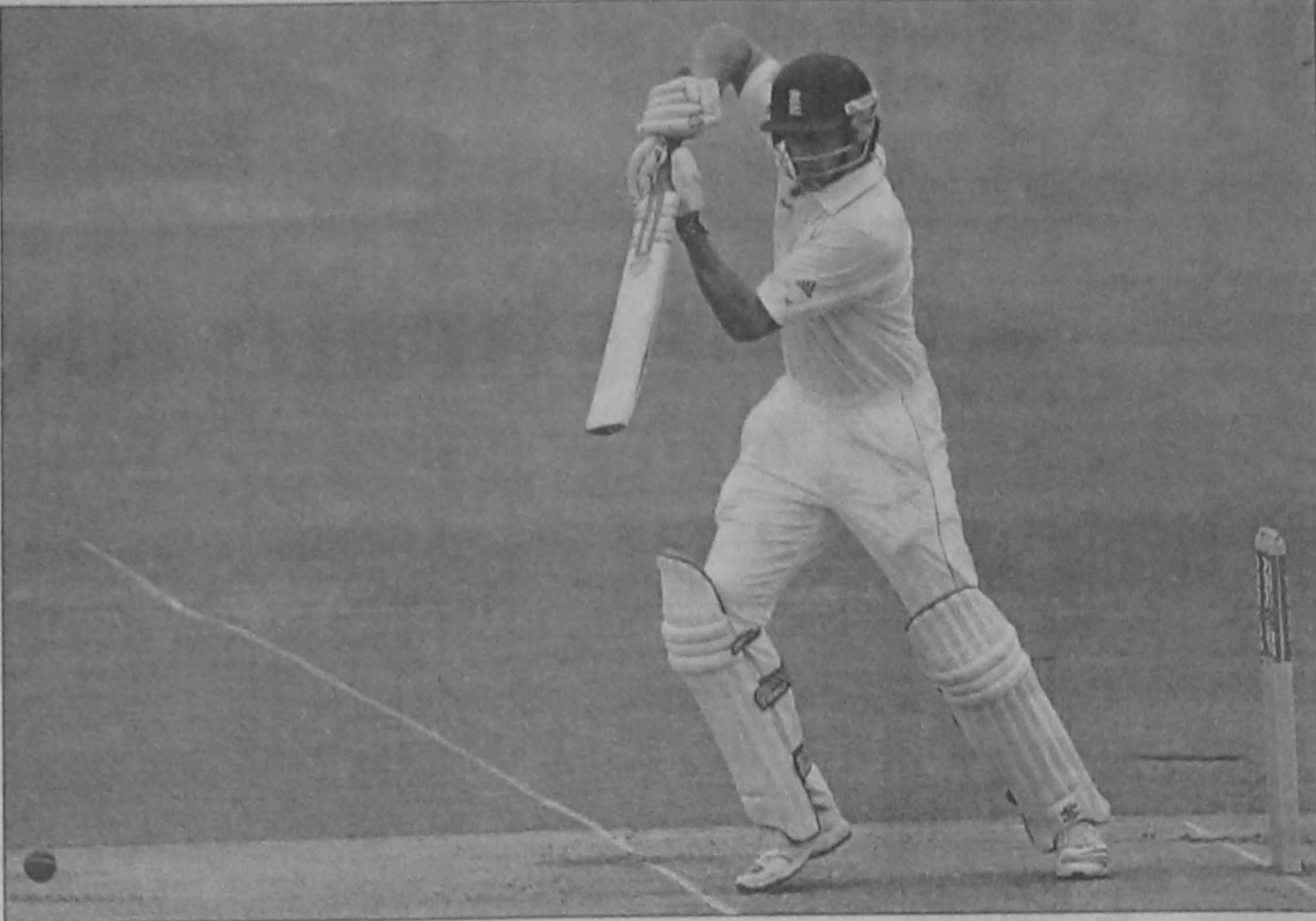
England opener Alastair Cook is a picture of perfect balance as he punches the ball off the back-foot towards mid-off during the second day's play of the first Test against England at Lord's in London yesterday.

The match will be telecast live on Bangladesh Television (BTV) from 9am.