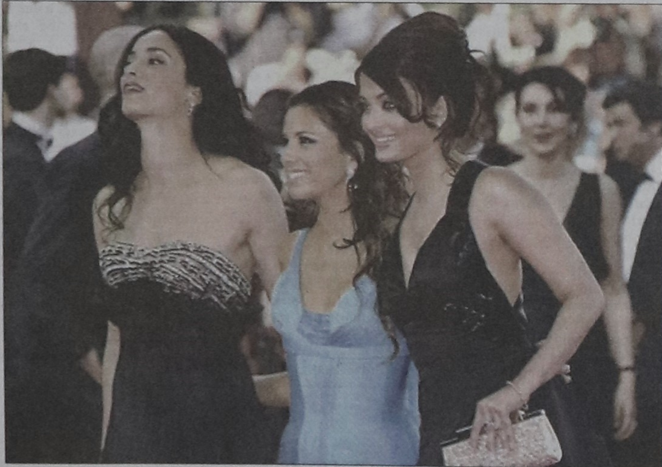
Aishwarya Rai (R) seen with other celebrities at the Cannes Film Festival