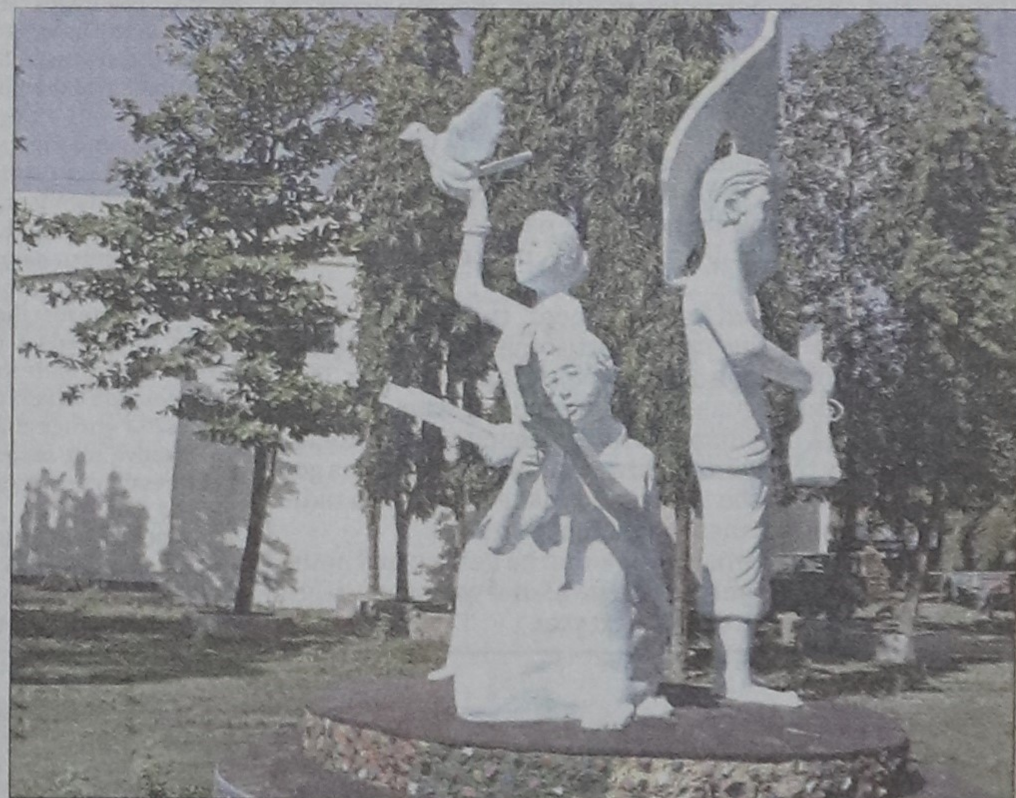
Town Hall in Khagrachhari

On the other hand, there is no water supply or toilet facility in the Zila Shishu Academy Auditorium, said cultural activists. Moreover, the auditorium is unable to meet the needs of a growing audience, as it only has 50-60 seats and needs renovation.