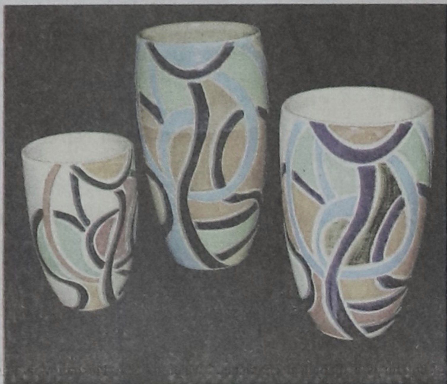
Ceramic works by Rehana Akter Nayan

water for a month and re-worked. The piece is prepared at the wheel and left to dry at room temperature. Then comes the exciting bit the first or bisquit firing, where the piece is burnt at low temperatures (700-900°C). After its removal from the kiln, the piece is