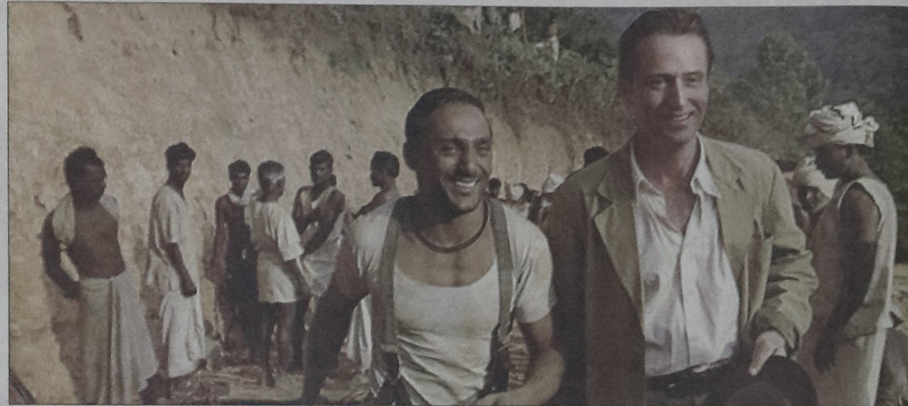
Rahul Bose (left) and Linus Roache in Santosh Sivan's period drama Before the Rains

Before the Rains , director Santosh Sivan's drama set in 1937 India, is a hodgepodge in the Raj -- a predictable patchwork of forbidden romance, English arrogance, a gun given as a gift, suicide, corruption, deception, rising Indian nationalism and a short-lived chase through the jungle.