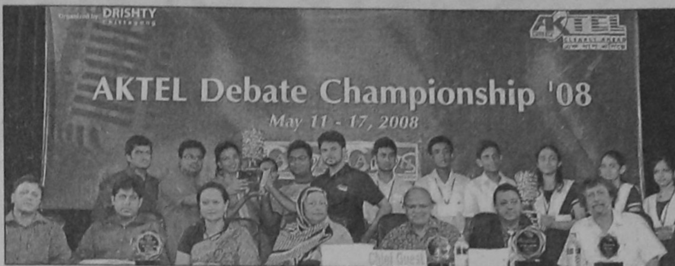
Winners of "Aktel Debate Championship-2008" at school and university level contests pose for photograph with the guests at the closing ceremony at Theatre Institute of Chittagong auditorium yesterday.