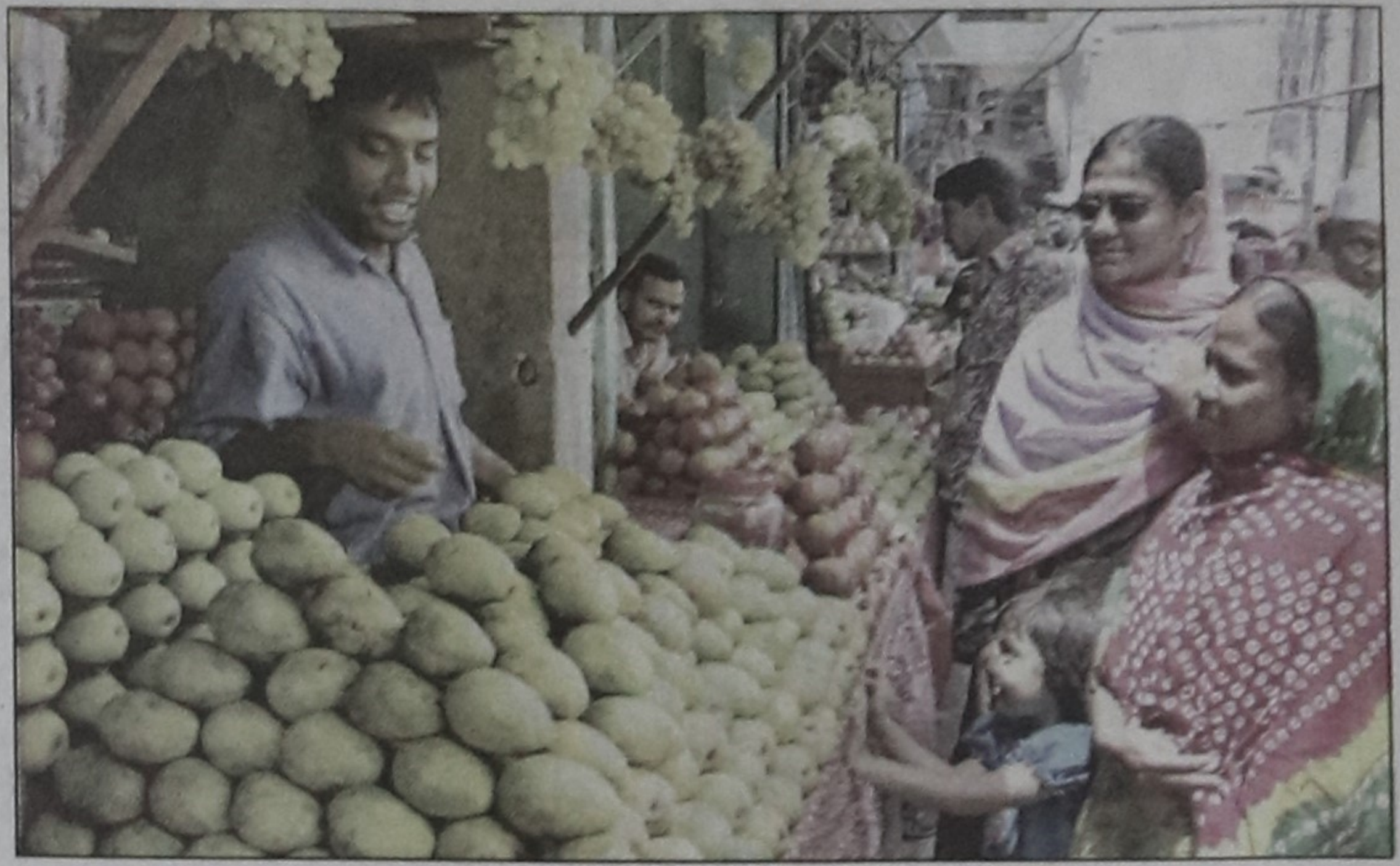
Gopal Bhog variety of juicy summer fruit mango is selling at Tk 60 to 70 a kg in Rajshahi markets. The photo was taken yesterday.

The number of voters on the final list stood at 2,56,000 this time against 1,82,000 in the first city corporation elections held in 2003.