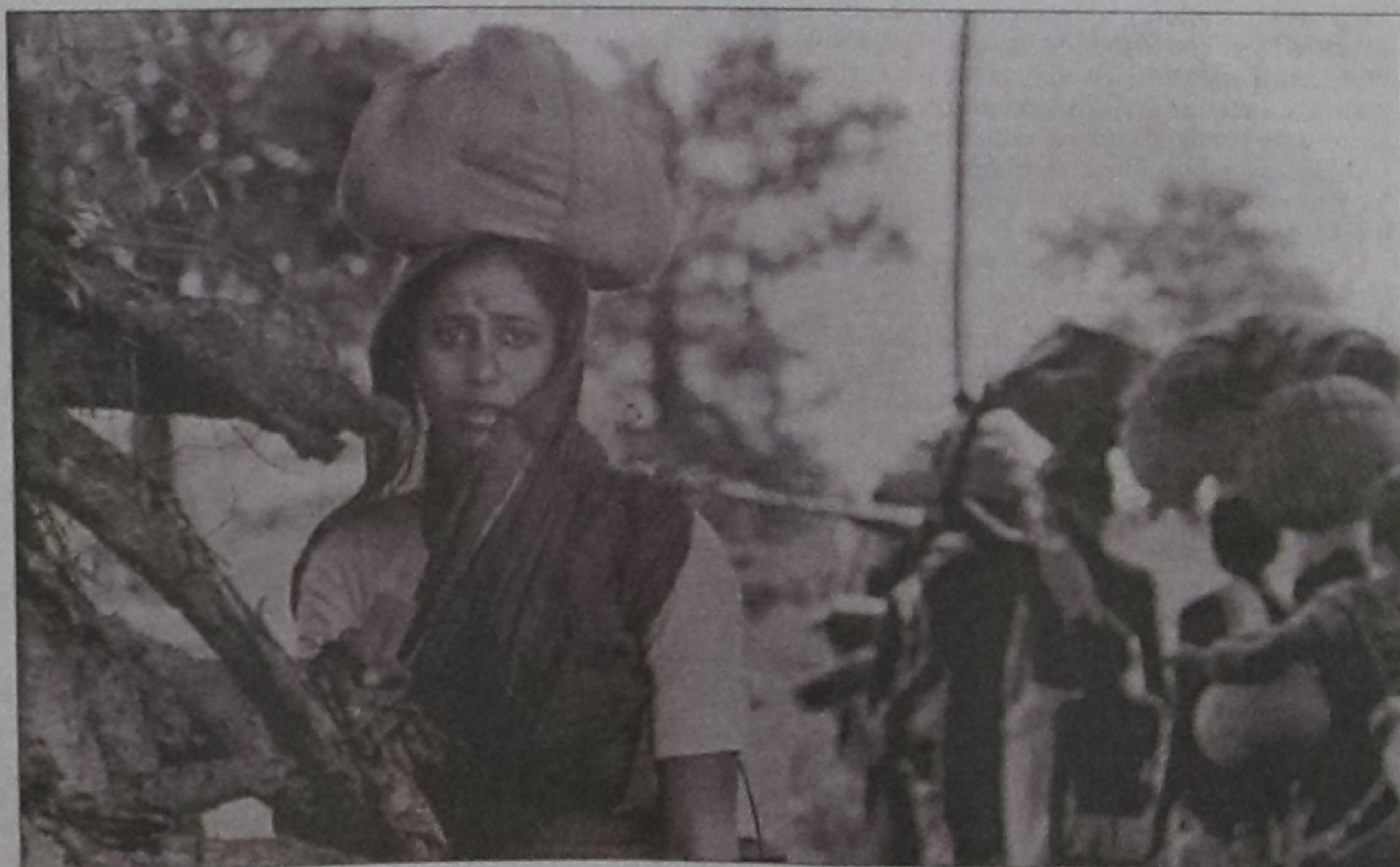
Smita Patil in Akaler Shandhaney