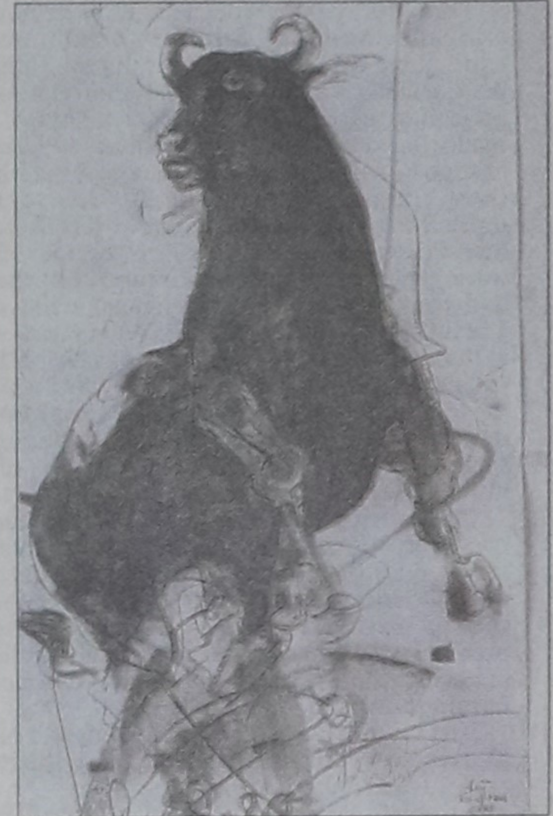
Drawings by Ranjit

Inspired by the defiant bull done by Shilpacharya Zainul Abedin, Ranjit has sketched his bull though this is from a totally different angle. The fleeing horse is full of vigour and is presented repeatedly with impact. The dog and the goat are also remarkable.