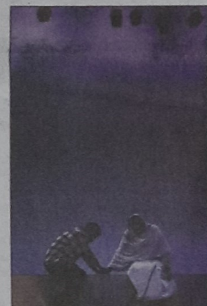
Scenes from Shaht Ghatir Kana Kori (left) and Khamakha Khamakha