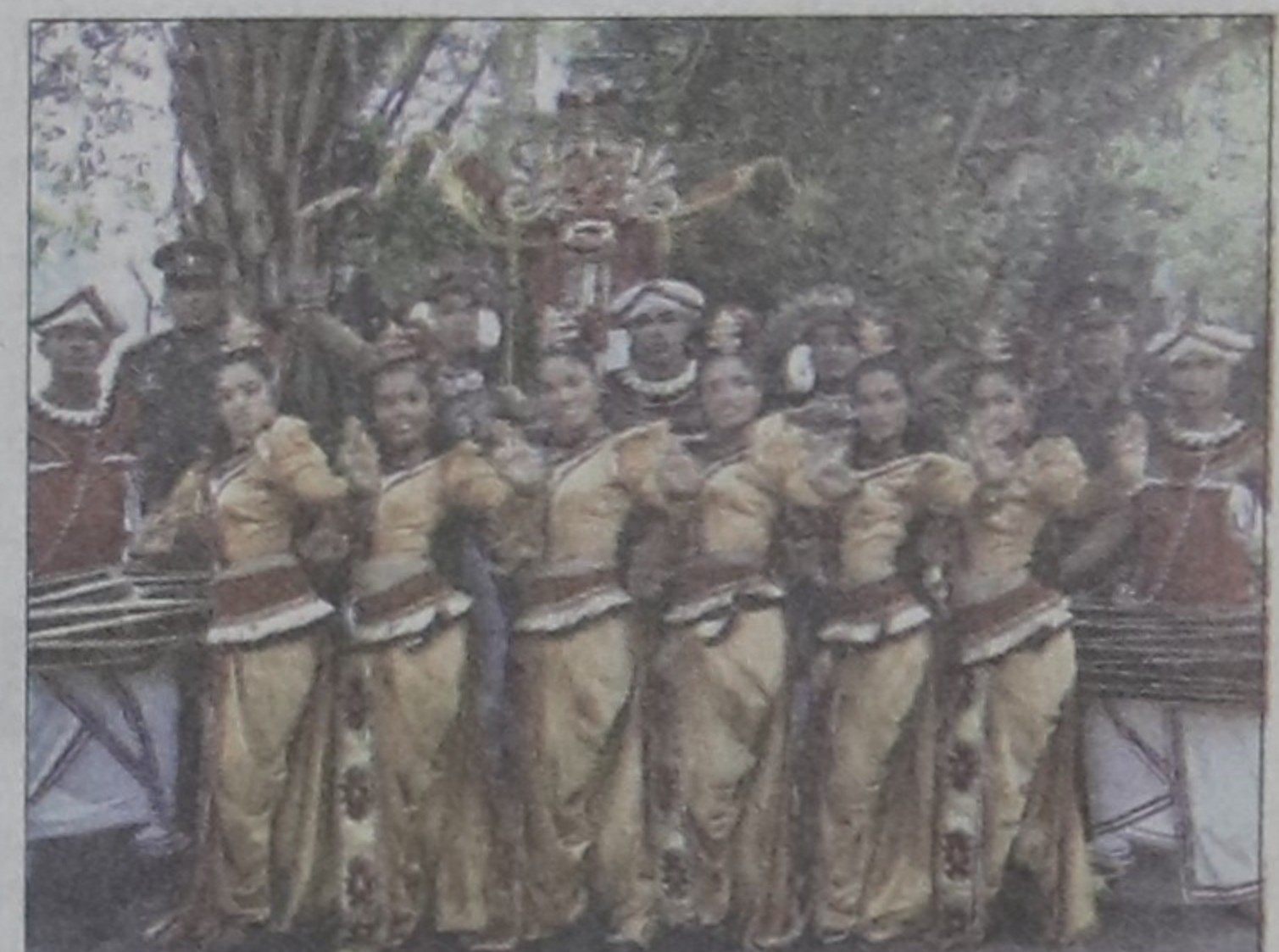
The Sri Lanka Army Cultural Dance Troupe

Passes will be available at all expat clubs and the Sri Lankan High Commission in Dhaka. Funds raised from the event will be donated to the Ahsania Mission Cancer Hospital.