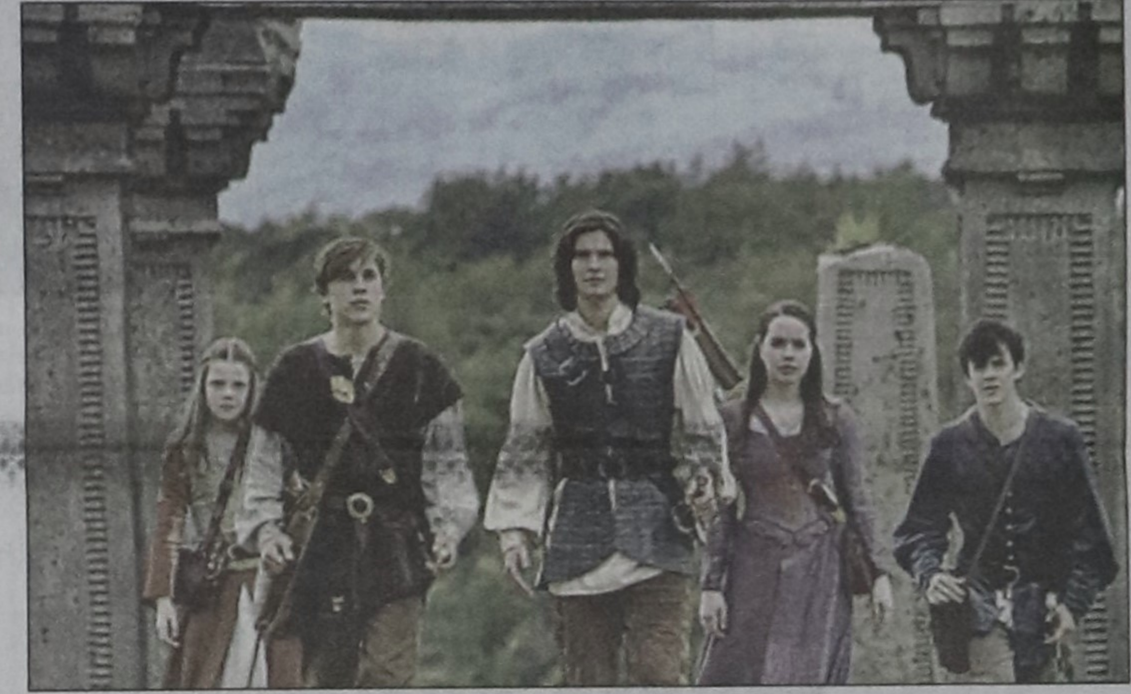
(From left) Georgie Henley, William Moseley, Ben Barnes, Anna Popplewell and Skandar Keynes in The Chronicles of Narnia: Prince Caspian