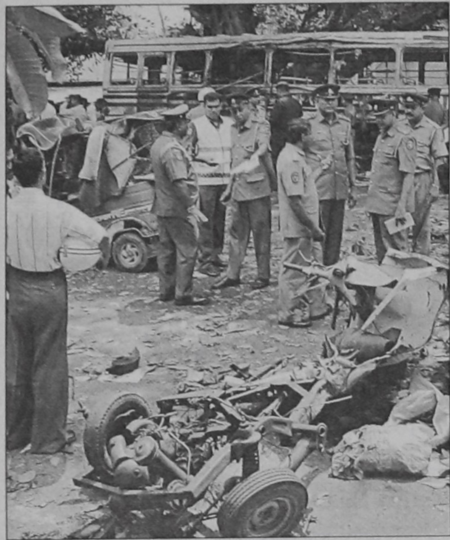
Sri Lankan police officials conduct investigations at the site of a suicide attack in which a motor-bike rammed into a bus carrying policemen in Colombo yesterday. At least 10 policemen were killed and over 90 people injured.