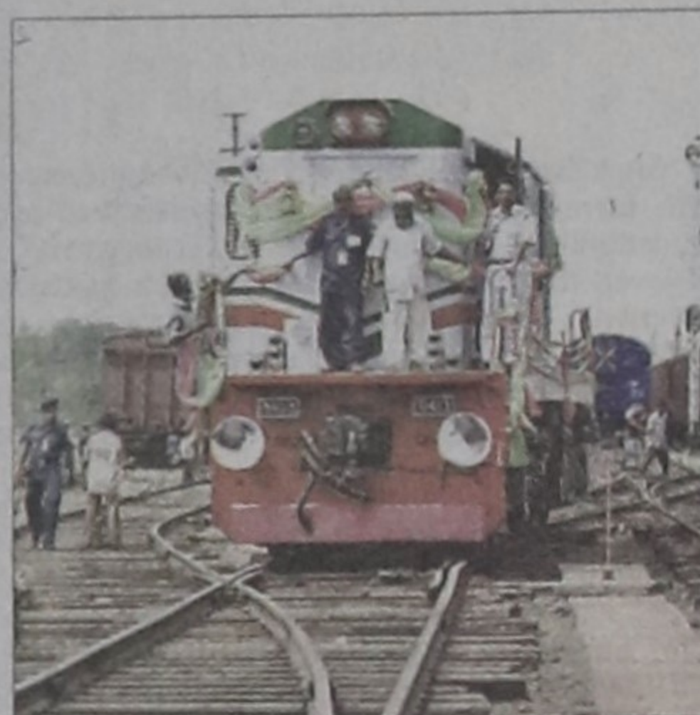
These file photos show Maitree Express having a locomotive change at Darshana Railway Station and, right, passengers inside the train get weary of the delay of over two hours there. The number of Dhaka-Kolkata train passengers is decreasing day by day due to lengthy immigration checks.