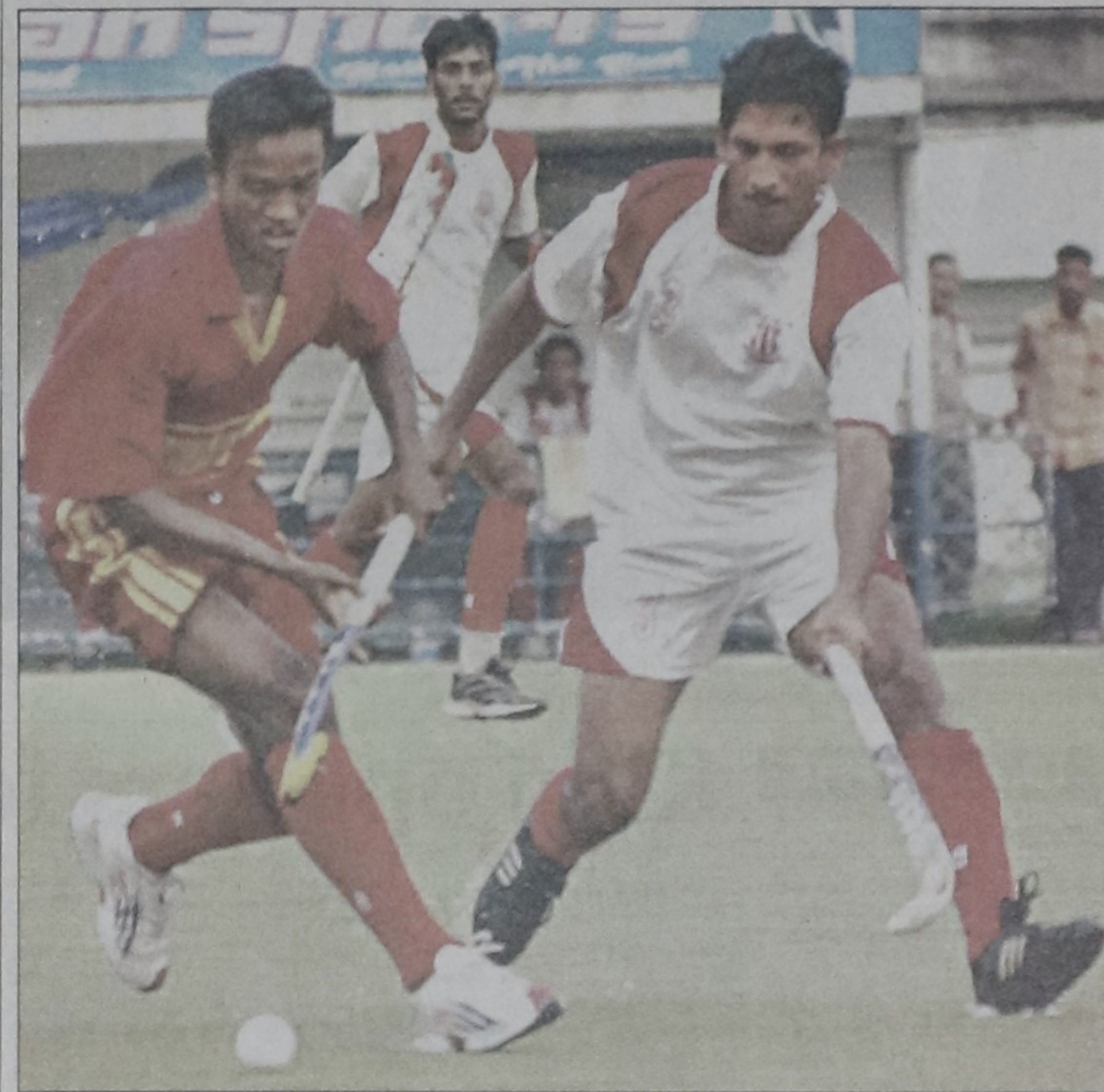
An action from yesterday's Premier Hockey League match between Azad Sporting and Wari Club at the Maulana Bhasani National Hockey Stadium.

After their second win, Azad reached six points -- one point adrift of Mariners -- while Bangladesh Sporting remained on one point.