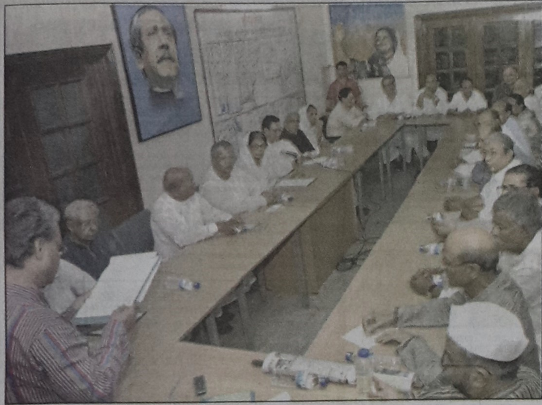
An emergency meeting of Awami League Central Working Committee (ALCWC) was held at the party's Dhanmondi office in the city yesterday.