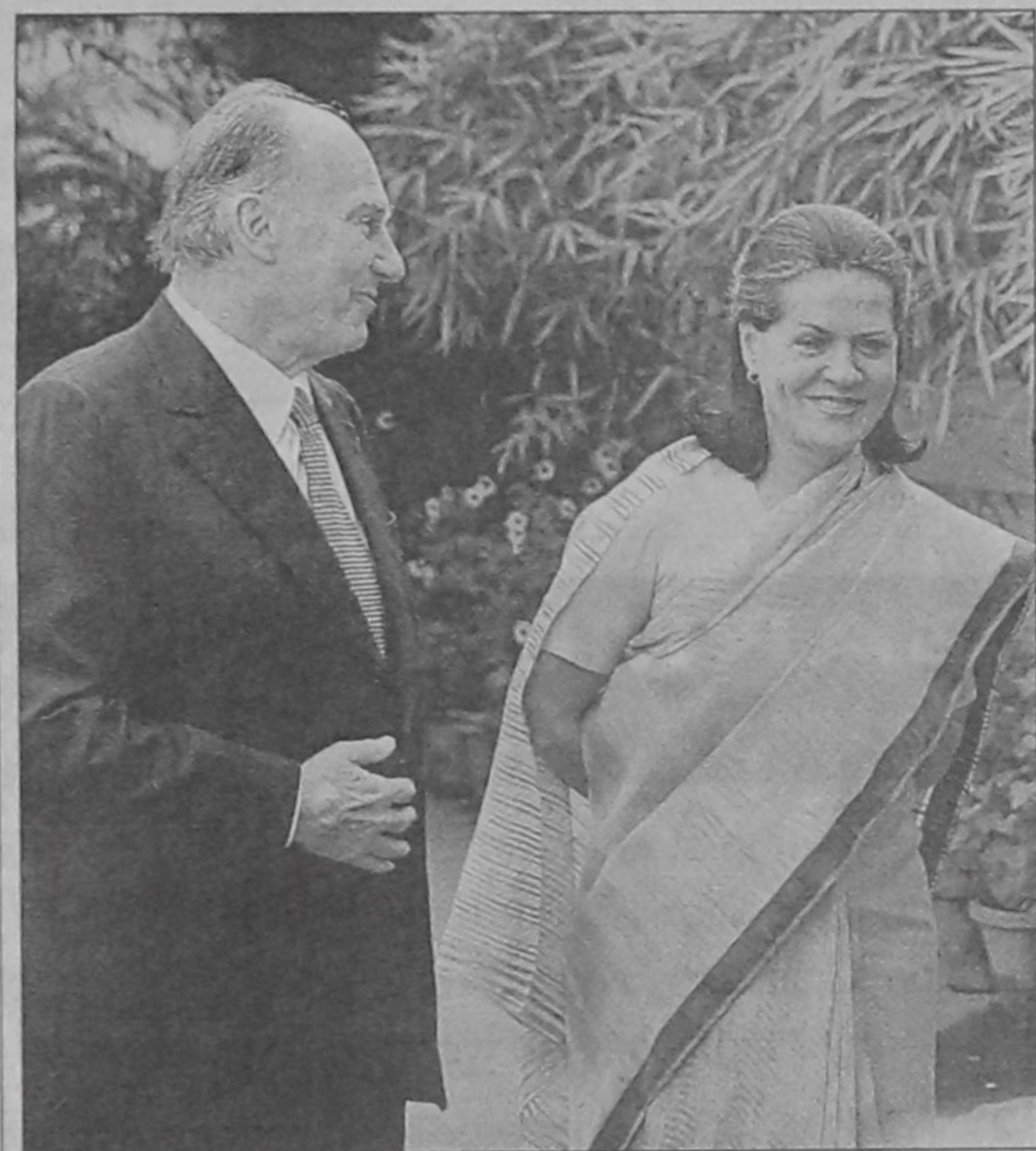
Spiritual leader of the Shia Imami Ismaili Muslims Aga Khan (L) talks with United Progressive Alliance (UPA) government and Congress Party President Sonia Gandhi (R) during a meeting in New Delhi yesterday.

Along with longer range Agni missiles, India will also carry out further tests of its special naval missile, an acronym used by DRDO scientists for a submarine launched ballistic missile, and the second test of interceptor missile which will be undertaken by September-October.