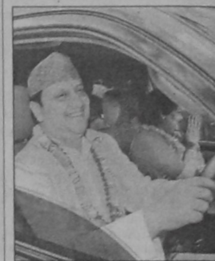
Nepal's King Gyanendra Shah (L) and Queen Komal Shah leave in their car following their five-sacrifice annual event in the Hindu temple at Dakshinkali, some 18 km south of Kathmandu yesterday.

The rebels said the attacks were in retaliation for an Indian army operation in which 12 of their cadres were killed. The army however said no anti-insurgency operation had been conducted in recent days.