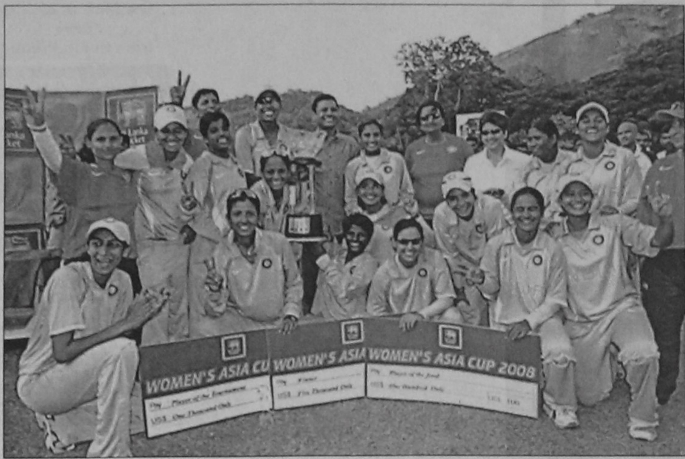
Members of the Indian women's cricket team celebrate their Asia Cup triumph in Kurunegala yesterday.

SPORTS REPORTER Bangladesh Hockey Federation (BHF) is keen to win the bid to host next year's 8th Asia Cup.