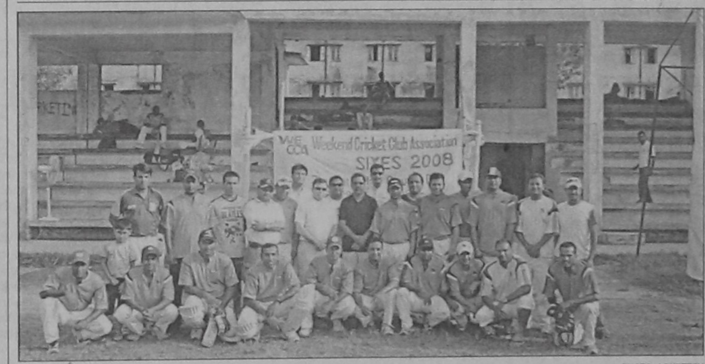
Players and organisers of the WECCA Sixes tournament pose after the final at the Jagannath Hall ground on Saturday.