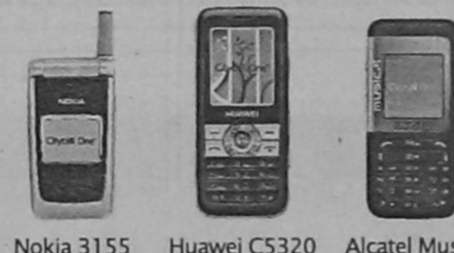
Nokia 3155 Huawei C5320 Alcatel Music

Helpline : 121, 011 99 121 121 (from any phone) E-mail: customerservice@citycell.com | Website: www.citycell.com