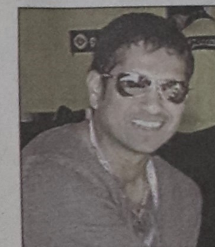
Sachin Tendulkar (Star Indian batsman) "The Indian Premier League (IPL) has taken the game to virtually every house in the world."