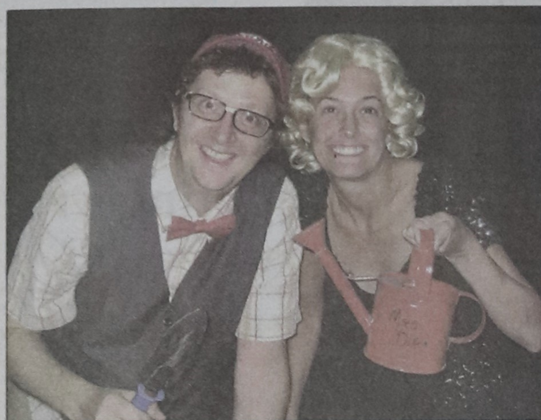
Scenes from the play