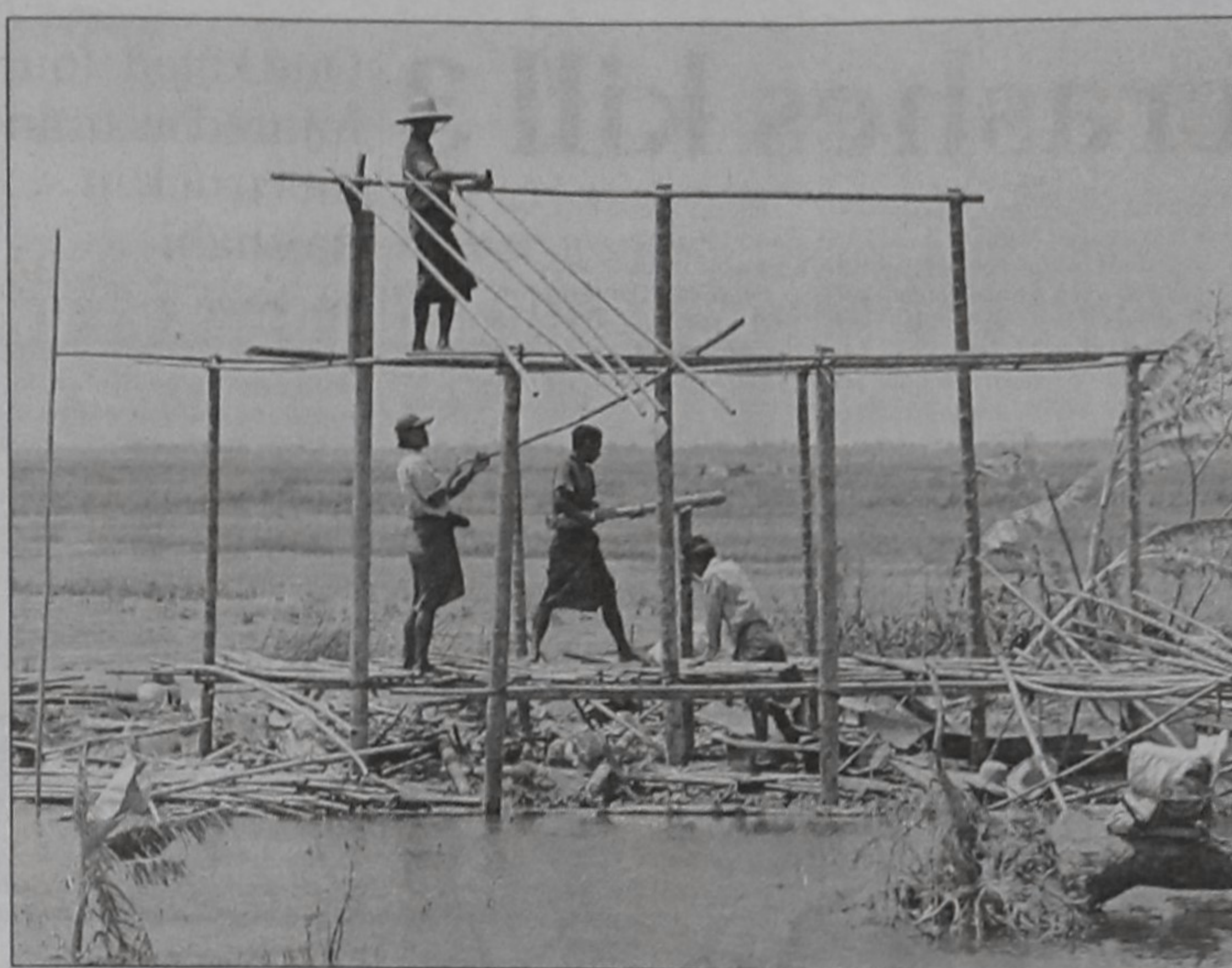
Residents rebuild a house after the killer Cyclone Nargis near Bogalay Friday. Tens of thousands of people were killed after last week's storm, which struck the Irrawaddy Delta region hard.