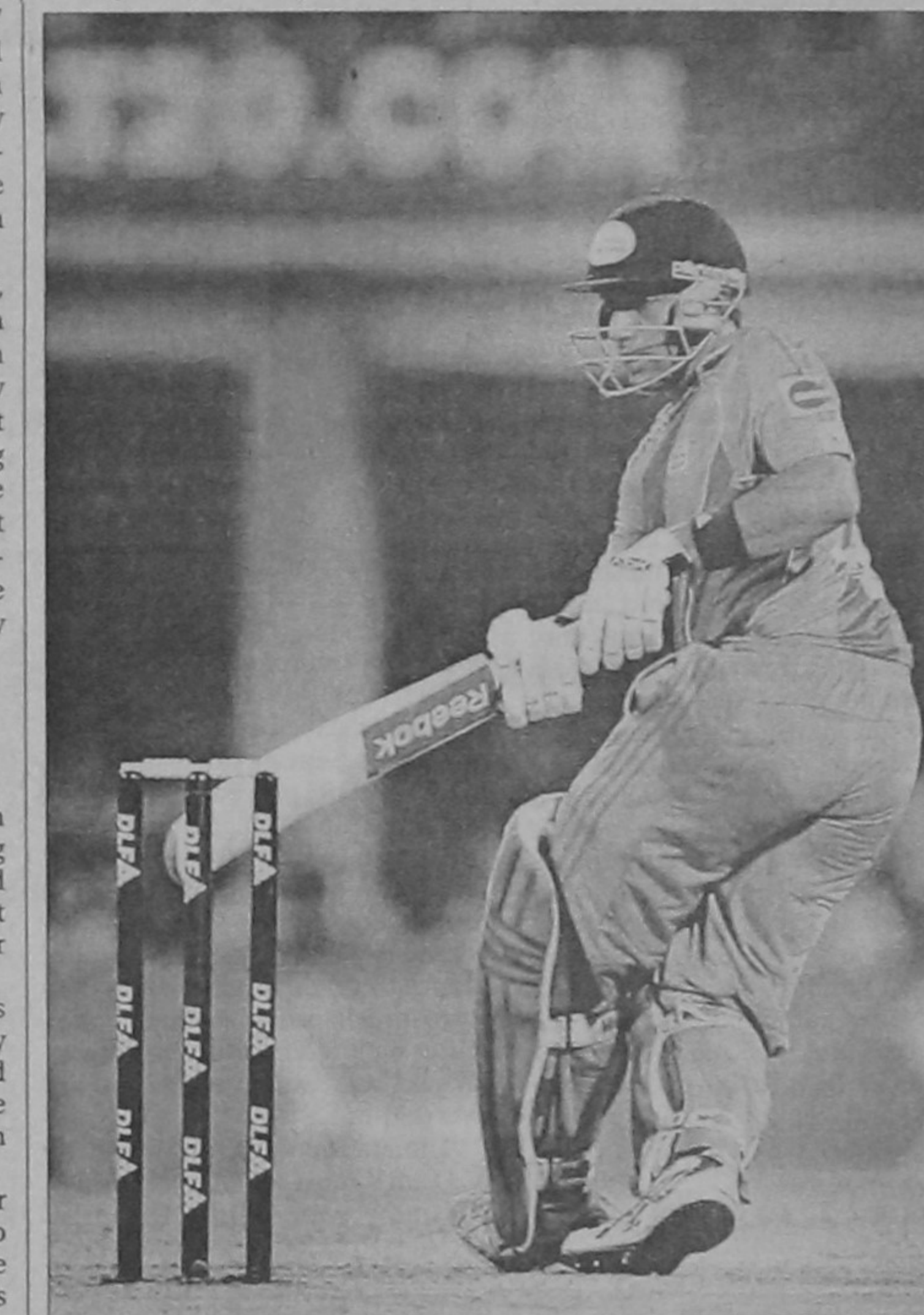
Mumbai batsman Robin Uthappa plays his trademark paddle sweep during his match-winning 34 not out against Rajasthan in the Indian Premier League in Mumbai on Wednesday.

Umpires: Daryl Harper and Rudi Koertzen.