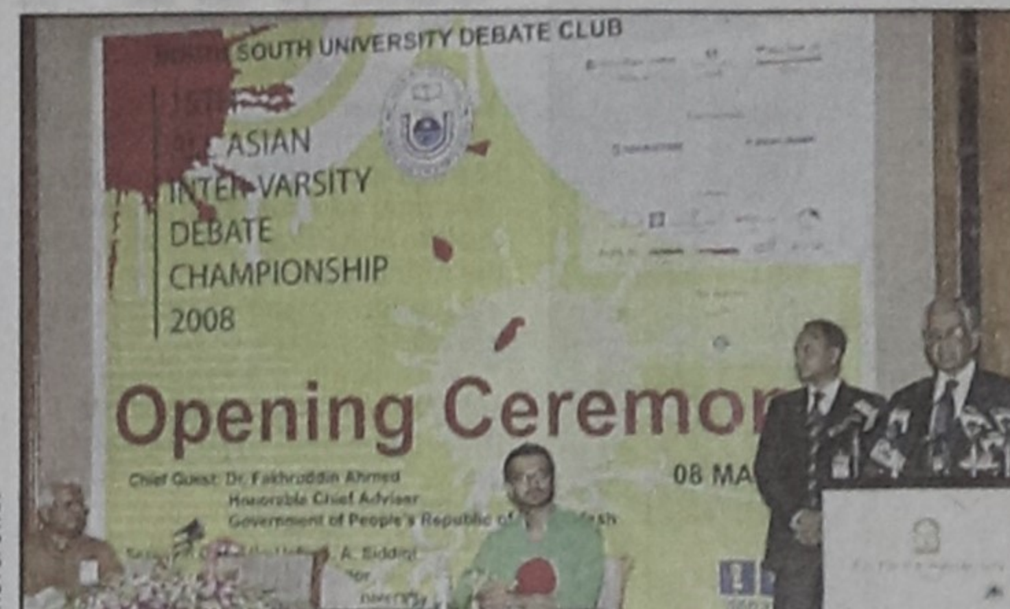
Chief Adviser Fakhruddin Ahmed speaks at the inaugural function of the 15th All-Asian Inter-University Debate Championship-2008 at Sonargaon Hotel in the city yesterday.

He said the All-Asian Inter-University Debate Championship is one of the most prestigious international debating tournaments in Asia, and the third largest in the world.