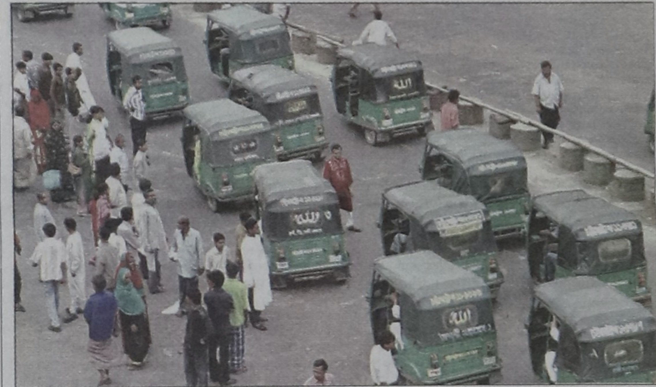
Drivers of CNG-autorickshaws stop using meter following price hike of Compressed Natural Gas (CNG).