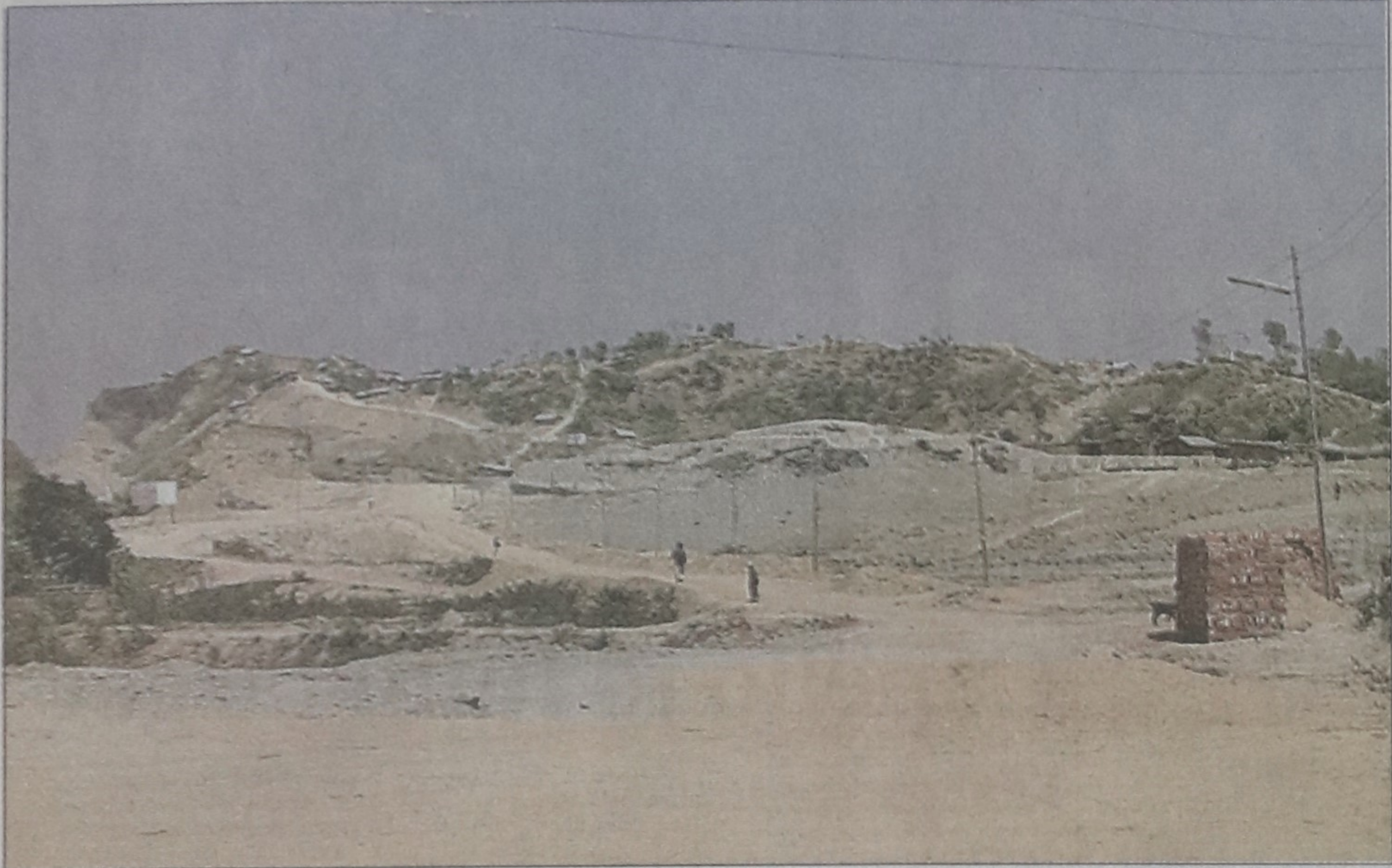
RECKLESS HILL CUTTING: The photo was taken from Lake City Residential project in the Foy's Lake area on Sunday.