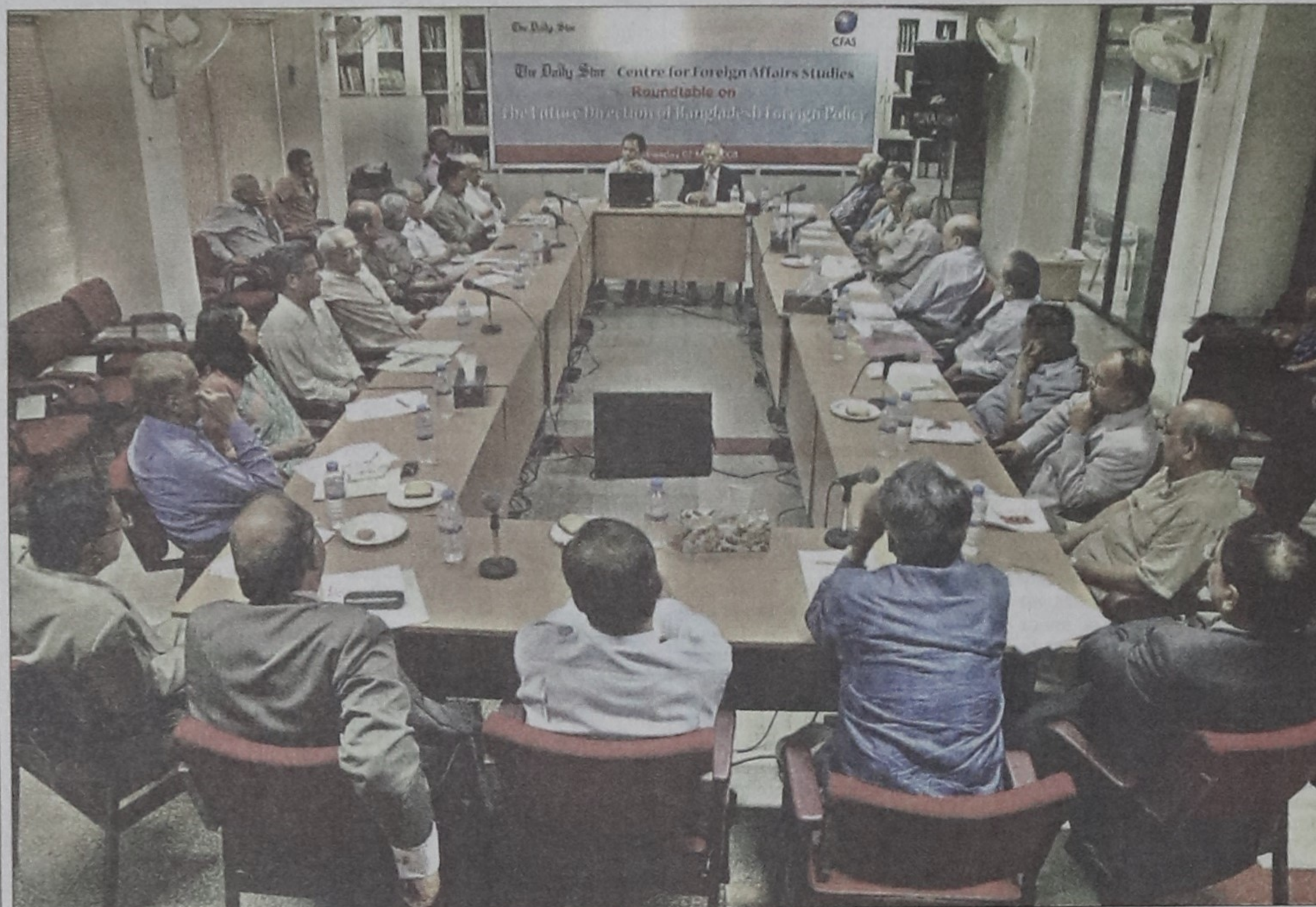
Participants at a roundtable titled "Future Direction of Bangladesh Foreign Policy" organised by The Daily Star and the Centre for Foreign Affairs Studies at The Daily Star conference room yesterday.