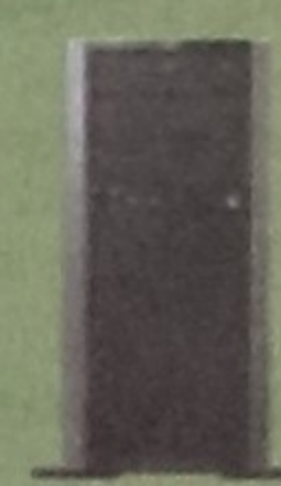
HP PROLIANT ML150 G5 SERVER

Technology for better business outcomes.