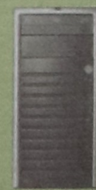
HP PROLIANT ML110 G5 SERVER