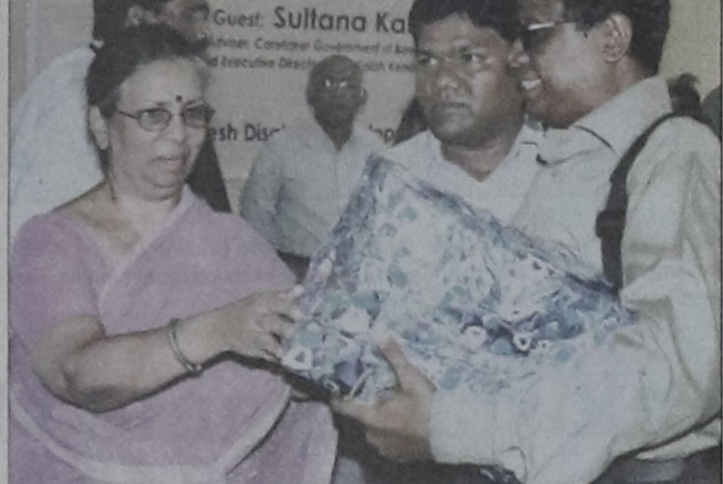
Former adviser and Executive Director of Ain O Salish Kendra Advocate Sultana Kamal hands over Braille books to a visually impaired student at Mirpur in the city on Monday.

Fakhruddin hoped that such programmes would be extended to the grassroots level to inspire people from all walks of life.