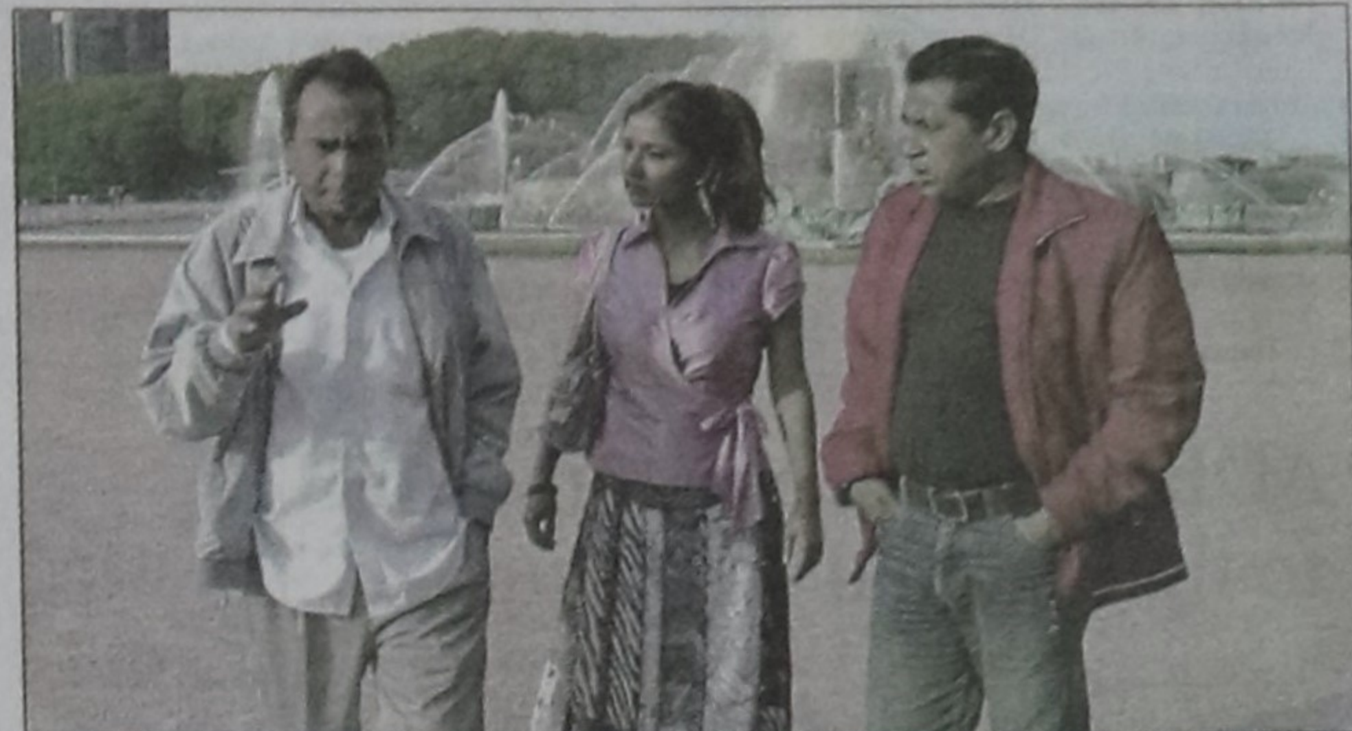
A scene from the film

Twenty-four films will be screened at the festival in five sections. The sections are: Special Family Film, Bangladesh Panorama, Kolkata to Mumbai, Spice of Life and Home and Away.