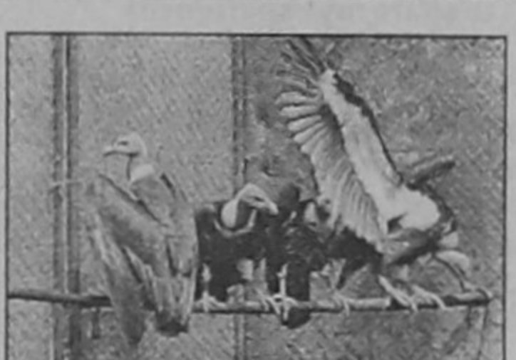
In this file picture taken in Ahmedabad on March 1, 2007 rescued vultures sit on a perch at the Animal Help Foundation.

Logistic Co-ordinator Medecins Sans Frontieres - Holland, House 42/B, Road 41, Gulshan-2, Dacca- 1212, Fax - (880) (0) 2 9893922, Tel- (0) 2 8814324, (0) 2 8861690