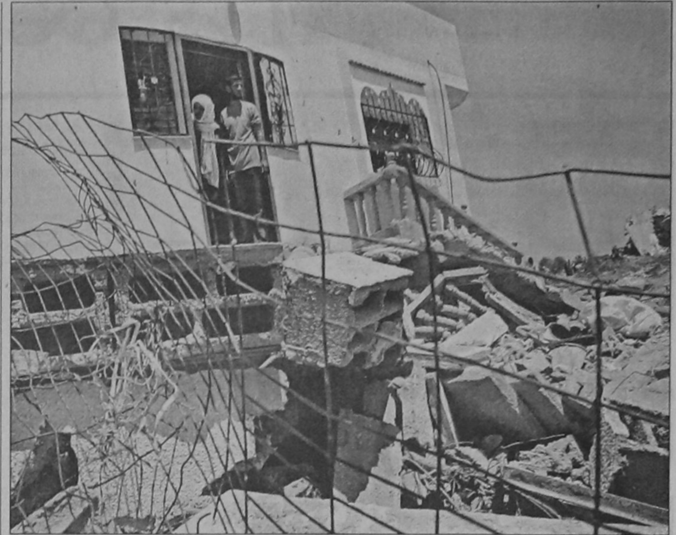
Palestinians gather to inspect the damage to their home following an Israeli operation in the southern Gaza Strip town of Khan Yunis yesterday. A Palestinian was killed and five others wounded after Israeli forces launched an operation overnight in the southern Gaza Strip, Palestinian medical officials said Sunday.

negotiations to ANP president Asfandyar Wali but he is not in contact with Taliban directly. Asfandyar tried to do something for the release of Pakistan Ambassador in Afghanistan but he was unable to establish direct contacts with Taliban for many weeks. Initially Pakistani Taliban denied their involvement in the kidnapping of Ambassador Tariq Azizuddin. He was kidnapped from Khyber Agency just few days before the elections in February. According to informed sources Pakistani Ambassador in Kabul was captured by a local group sympathetic to Taliban. This group kept the Ambassador in their custody for few days and then handed him over to Taliban leader Baitullah Mehsud in South Waziristan. They wanted Baitullah Mehsud to negotiate with Pakistan government for the release of their men, who were arrested before the elections.