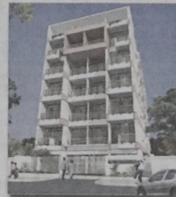
Troyee Cocnord Sector # 7