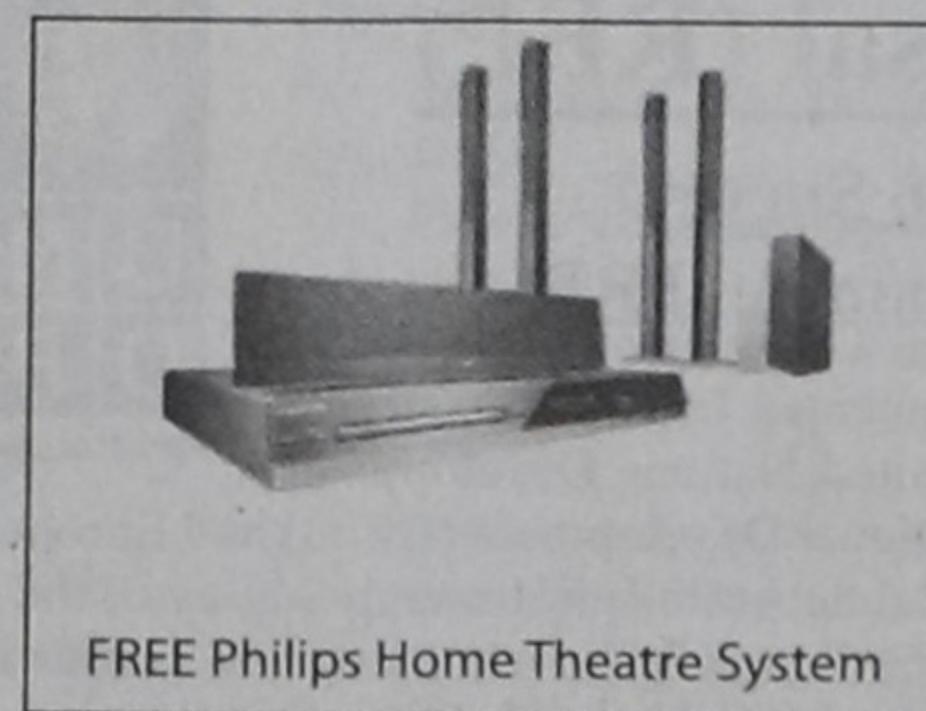
FREE Philips Home Theatre System

*Buy Philips LCD TV and get Philips Home Theatre System or Split Unit Air-Con FREE!