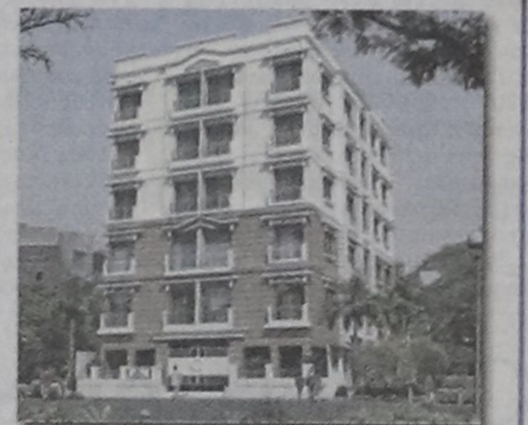
Concord Rose Heaven Sector # 10