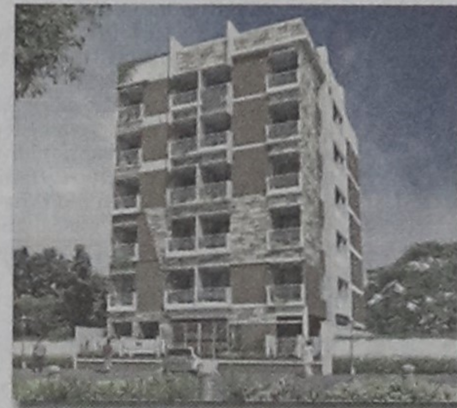
Maharika Concord Sector # 7