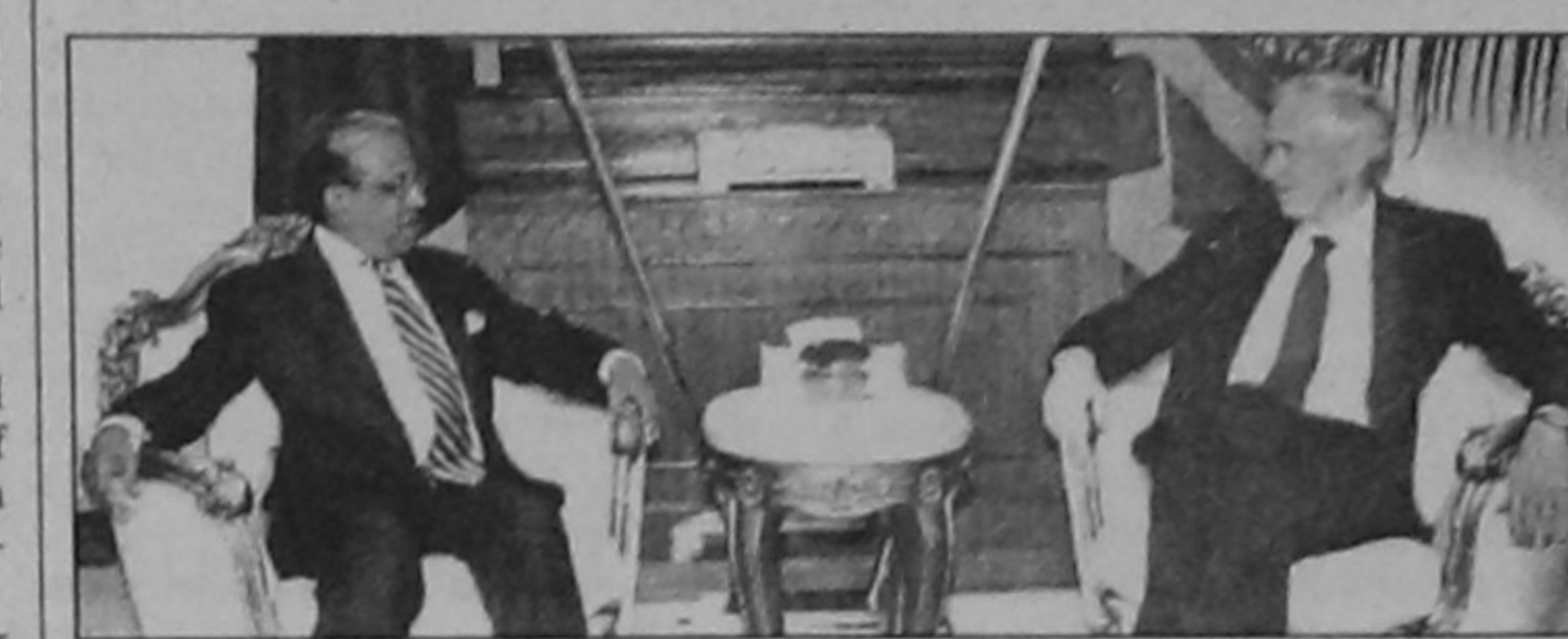
US Ambassador James F Moriarty calls on Chief Adviser Fakhrudin Ahmed at the latter's office in the city yesterday.