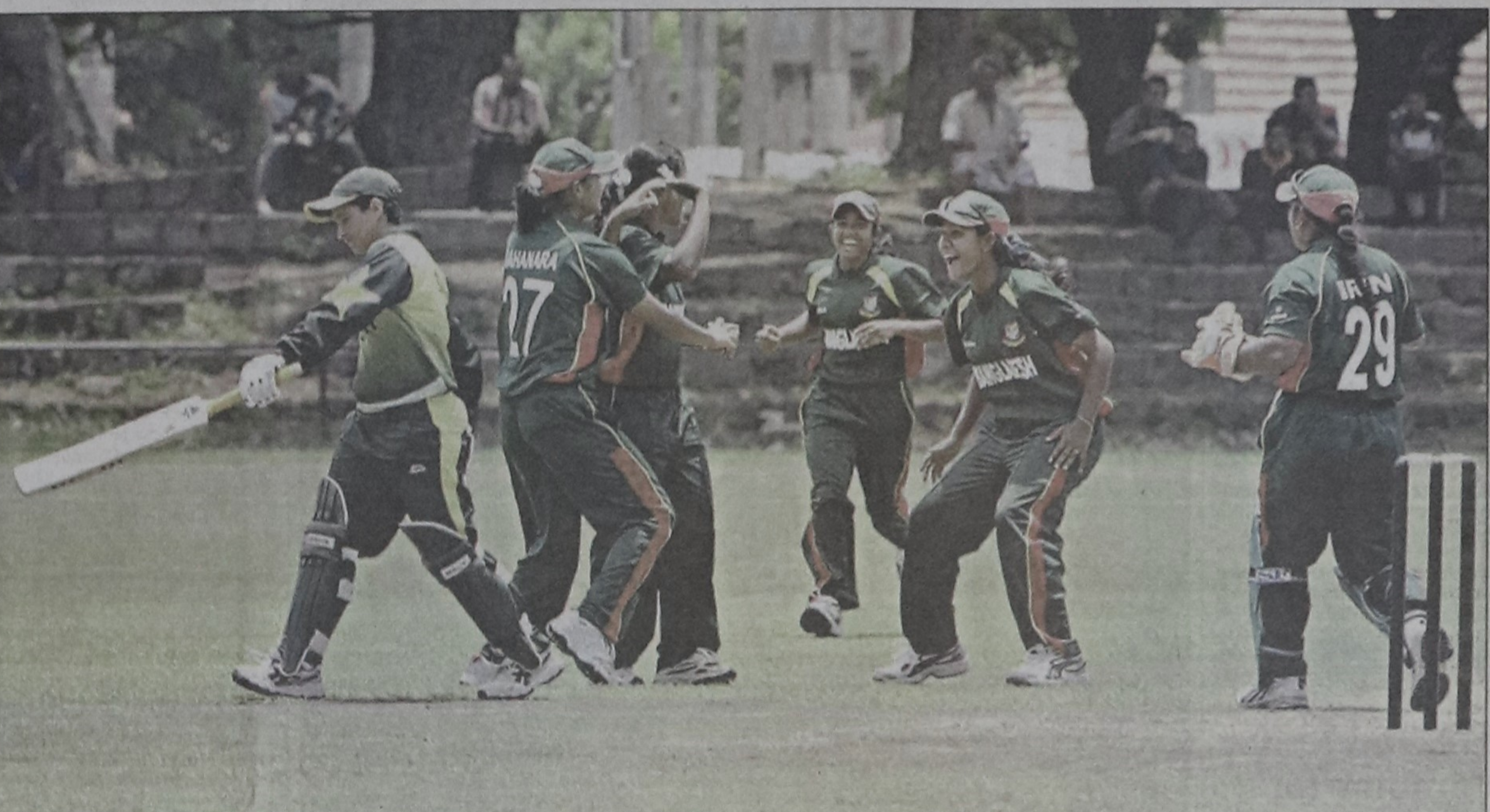
A PROMISE FULFILLED: Bangladesh women cricketers converge to celebrate the fall of another Pakistan wicket during their second Asia Cup match at the Welegedara Stadium in Kurunegala yesterday. Bangladesh defeated Pakistan by four wickets.