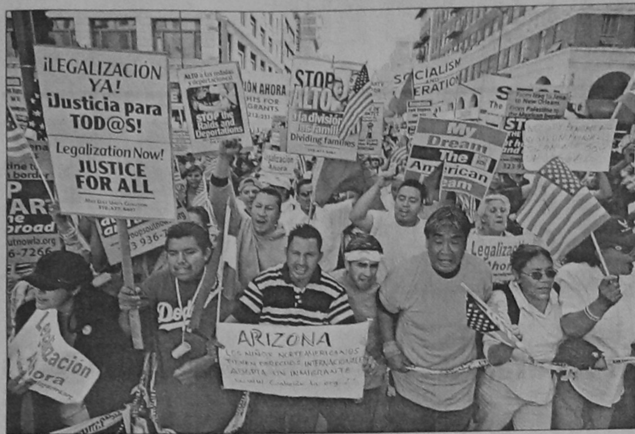
Demonstrators from three separate immigrants' rights groups march during a massive May Day rally in Los Angeles, California. Thousands turn out for the International Workers' Day immigration-rights marches and rally.