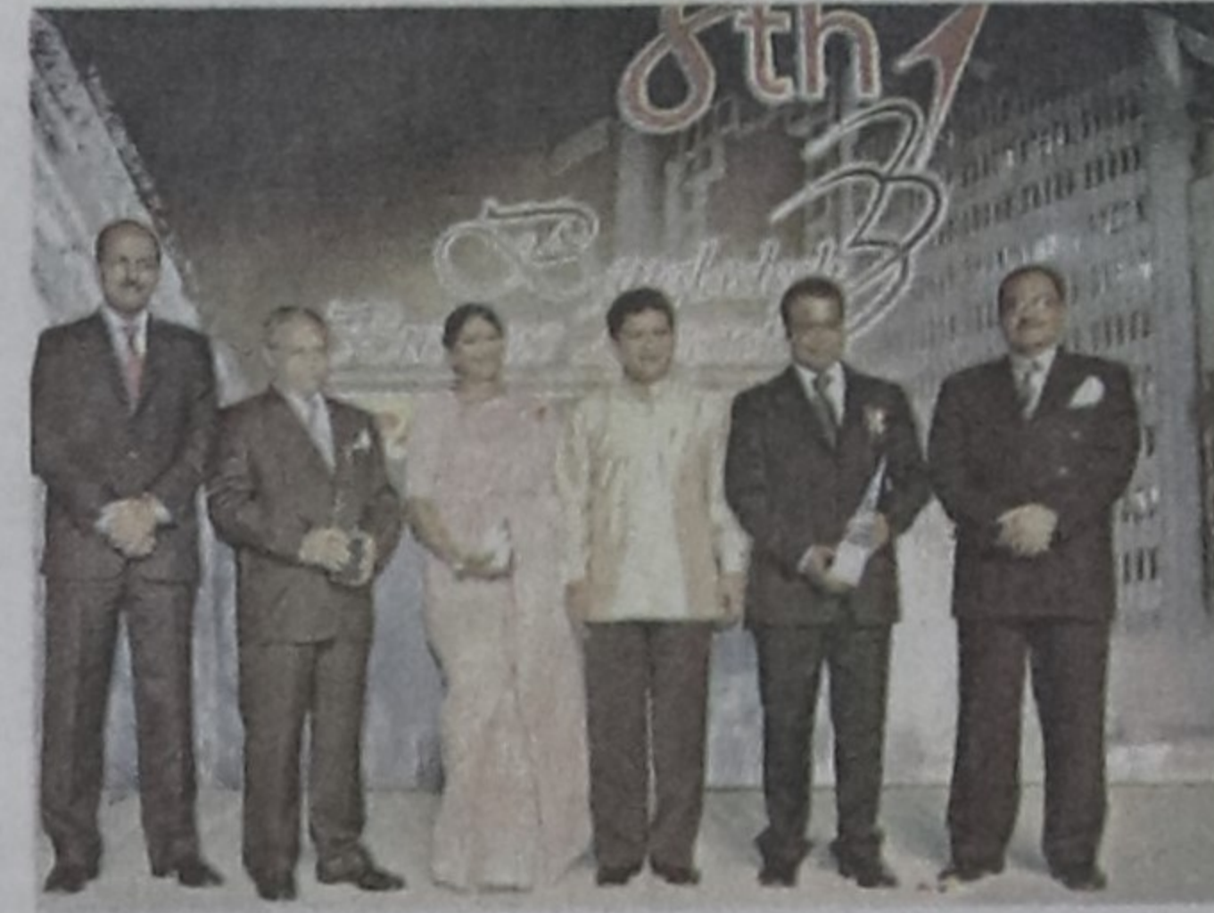
Bangladesh Business Awards 2007 On Channel i at 6:25 pm Jointly organised by The Daily Star and DHL Express

08:00 Drama Serial: Kala Koirar 08:35 Musical Programme: Cinema Ar Cinema 09:20 Drama Serial: Anondoajtra 11:00 Musical Programme: Just Band 11:30 Biz Event 12:00 Editor's Comment ntv 08:30 Aiker Shokaal 08:55 Drama Serial: Eit Kach-er