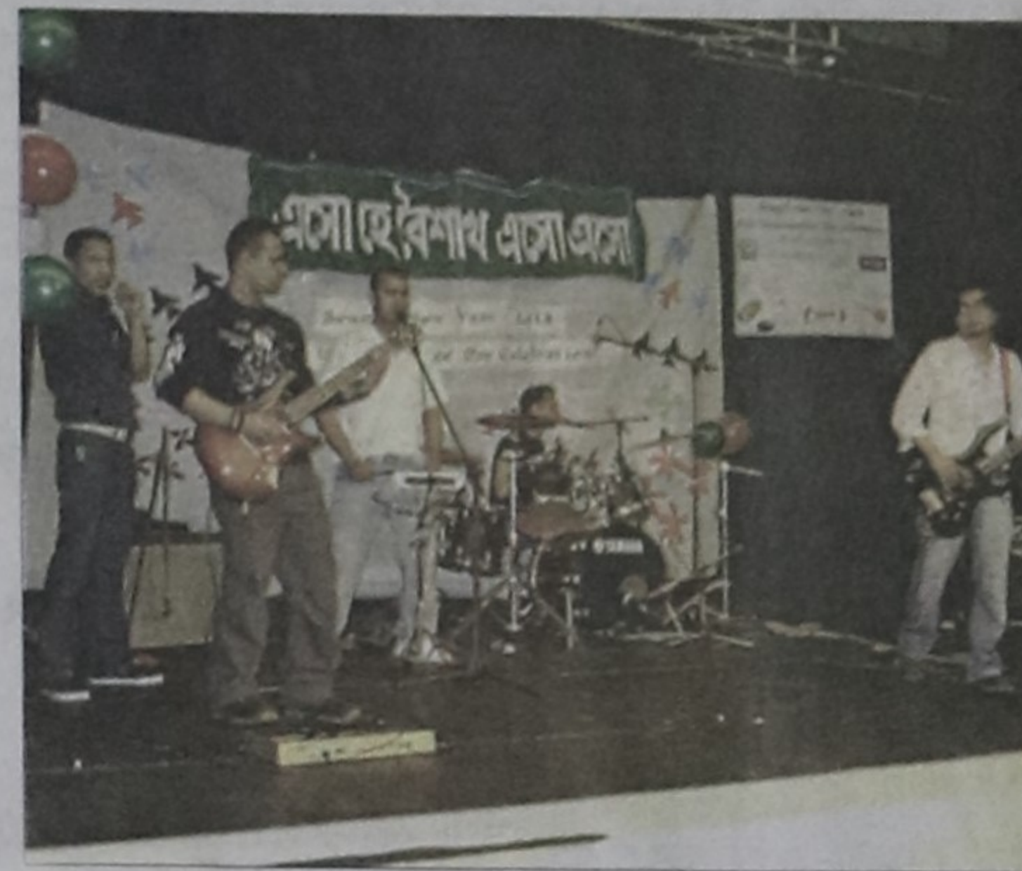
The band Silence performs at the programme

The exciting event wrapped up with an art competition for children.