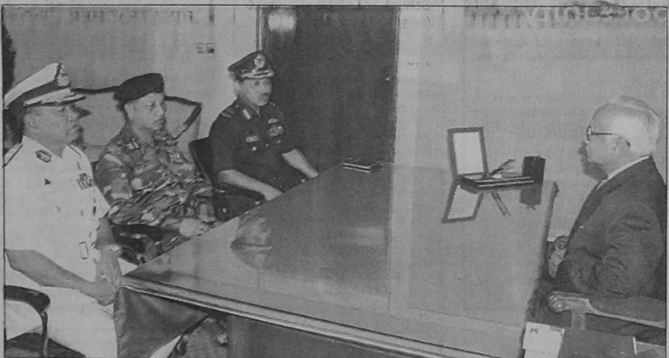
President and Supreme Commander of Armed Forces Iajuddin Ahmed yesterday attended his Armed Forces Division (AFD) office in Dhaka Cantonment.

The academic activities of the newly created department will begin soon.