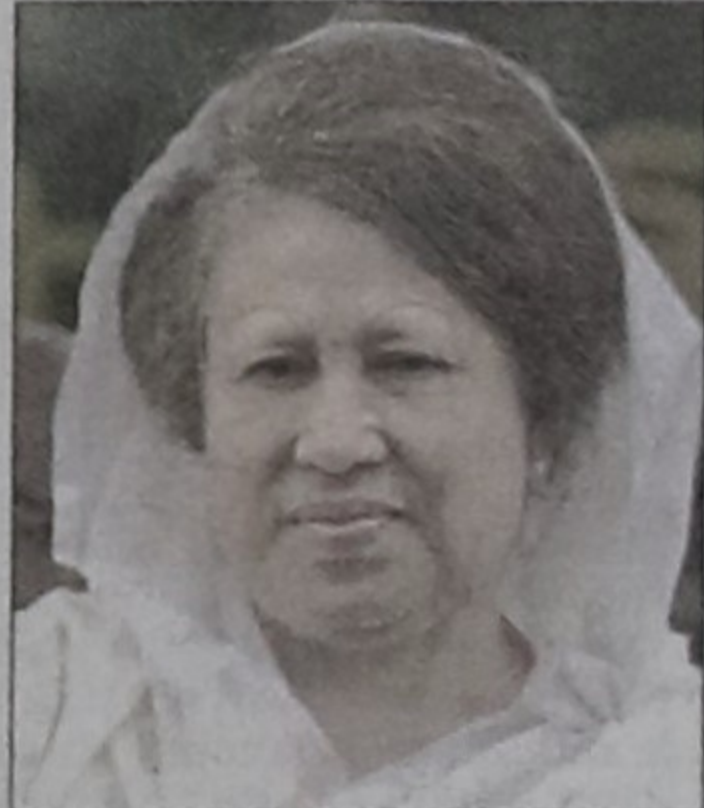
Hasina besides those already named in the case's FIR.