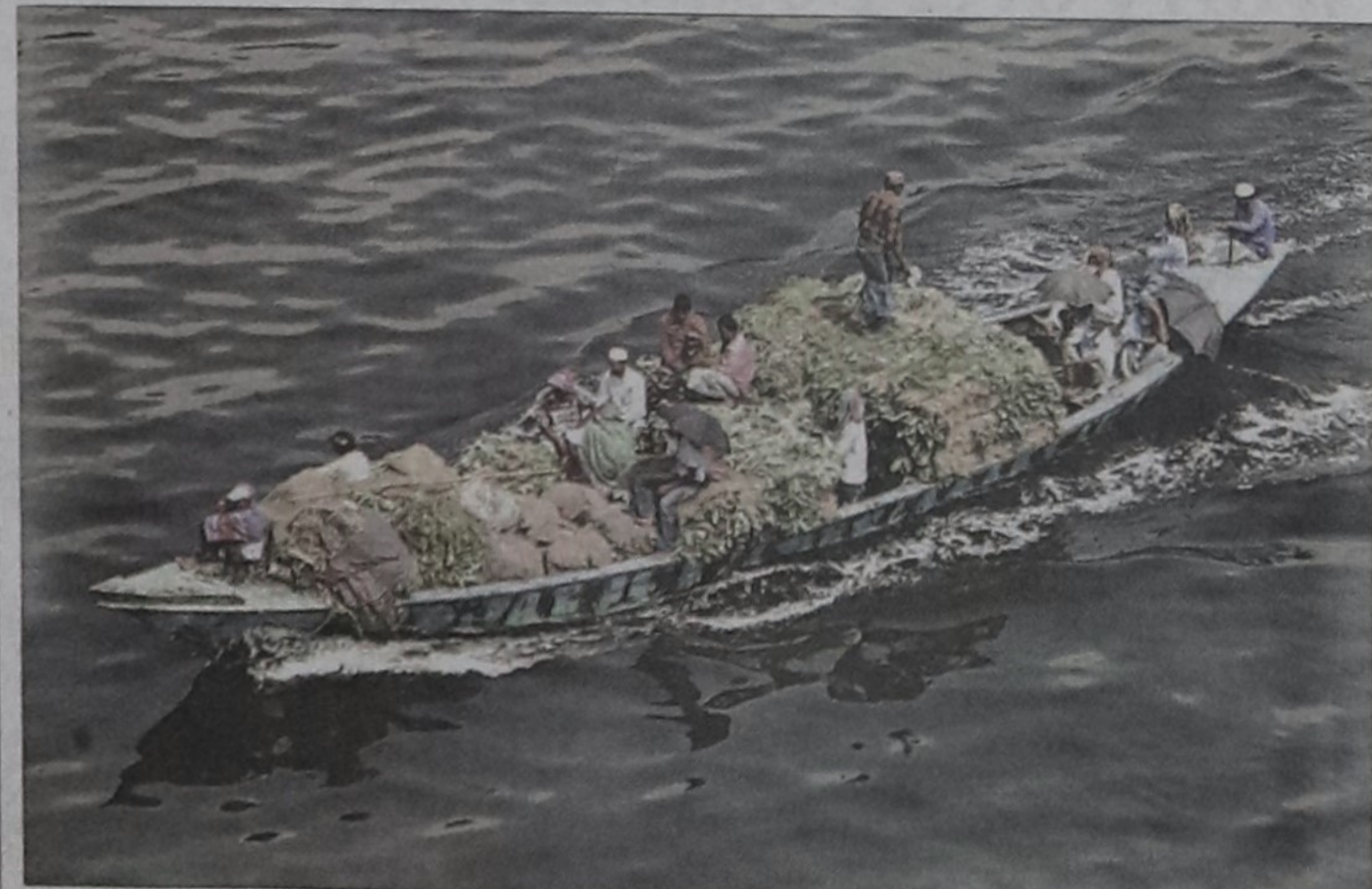
Wholesale vegetable traders cross the slimy waters of the polluted Buriganga every day to bring in fresh produce to the capital city.