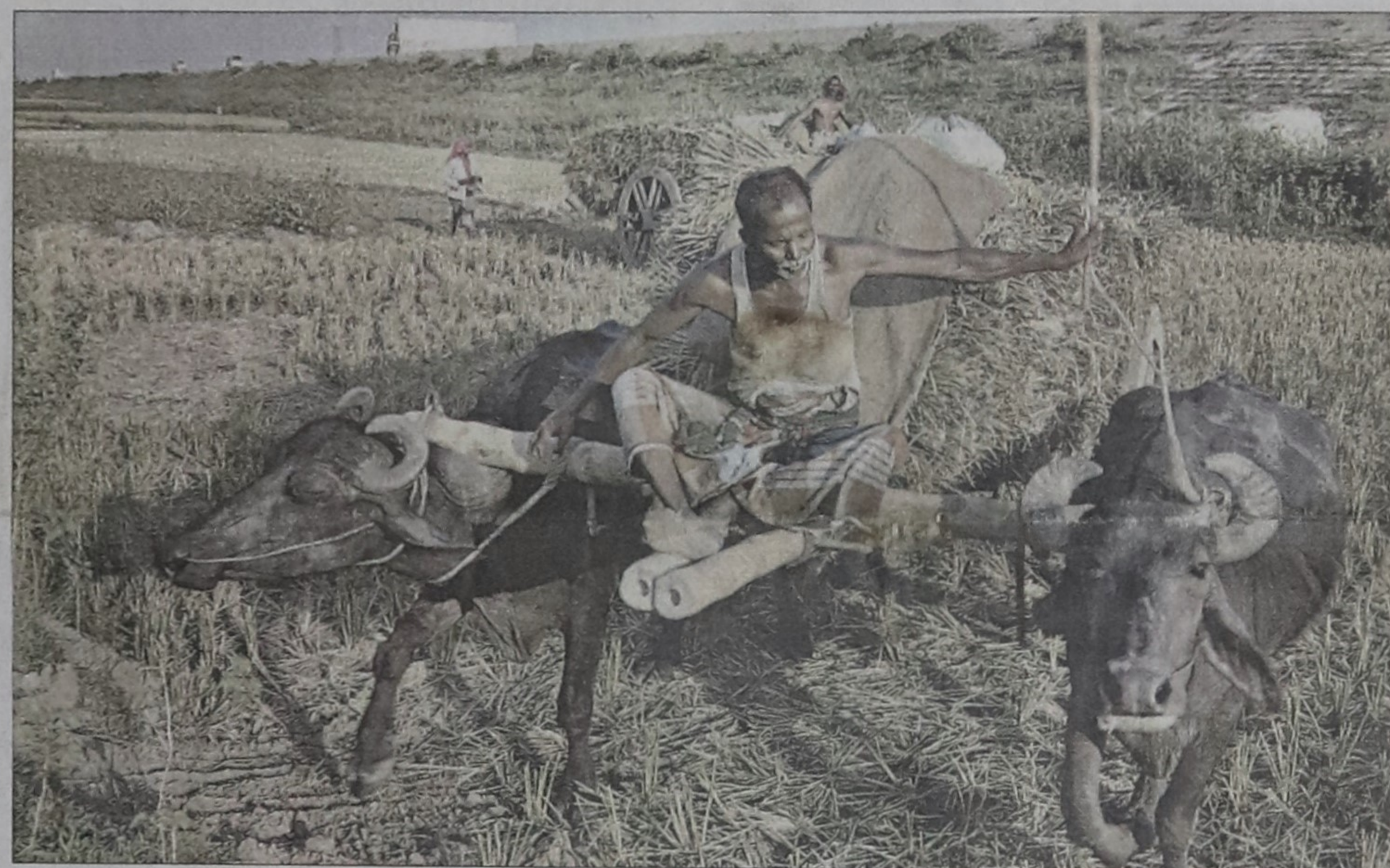
A farmer carries harvested Boro paddy on a bullock-driven cart in Savar yesterday. The farmers are getting a higher yield of Boro this season.