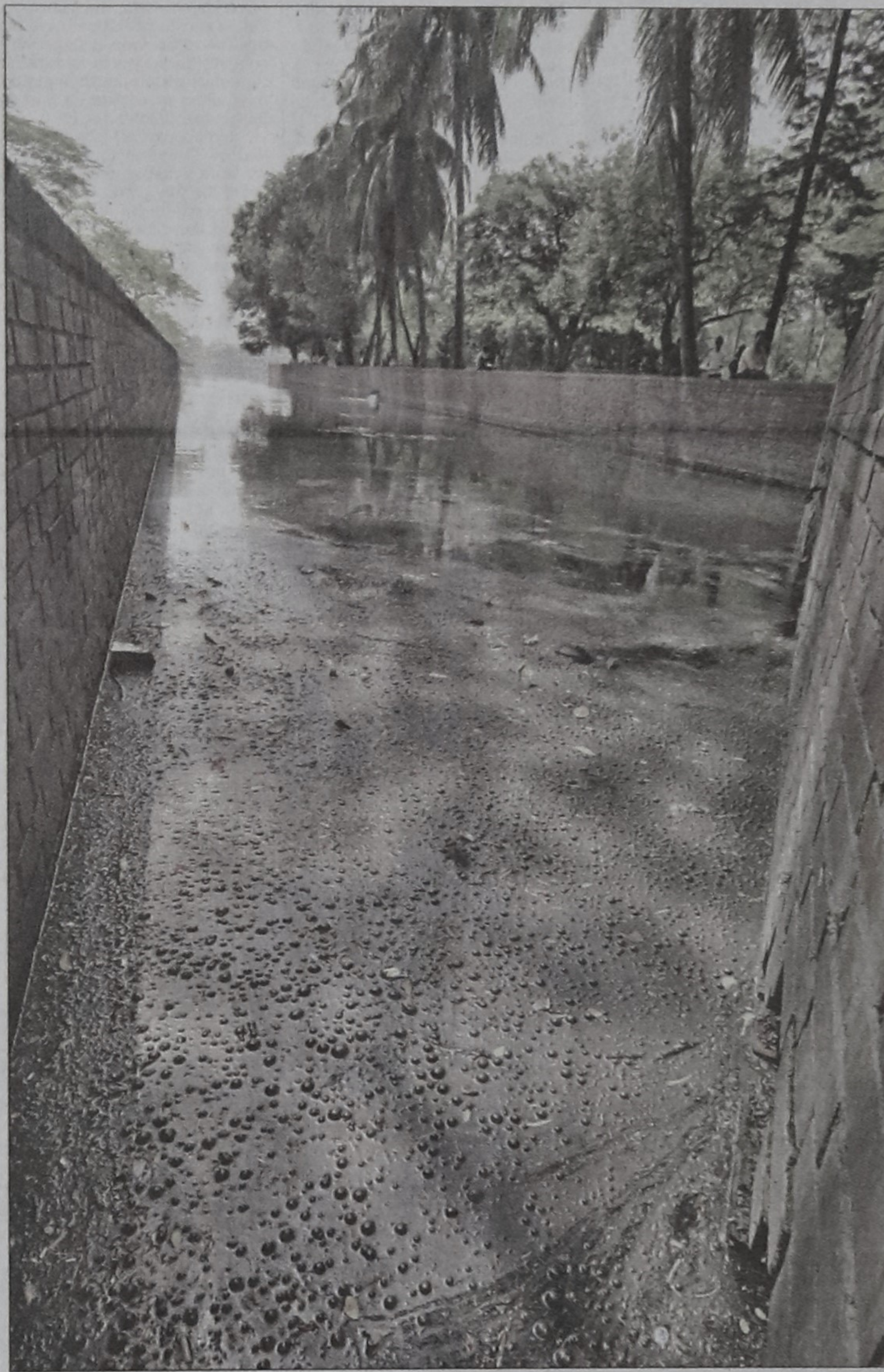
Water of the Crescent Lake near the Jatiya Sangsad Bhaban turns dark due to pollution. The photo was taken yesterday from the eastern end of the lake.