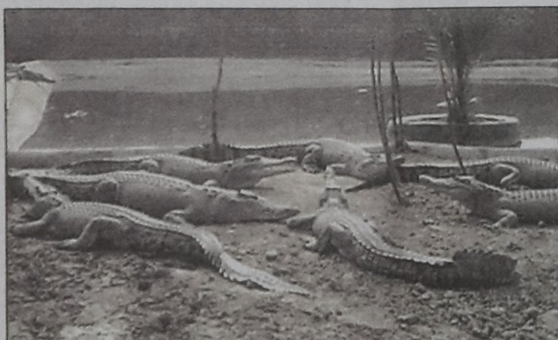
Crocodiles basking in the sun near an artificial pond in Reptiles Farm Ltd of Hatibeer in Mymensingh. Six-month-old croc babies swimming in a tank. The photos were taken last month.