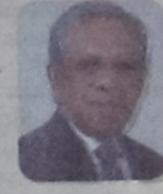
Chief Advisor Government of the Peoples' Republic of Bangladesh