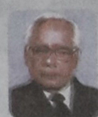
The Peoples' Republic of Bangladesh